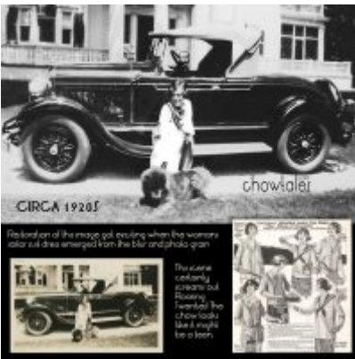
RESTORATION: 1920's Woman in sailor dress with ch...