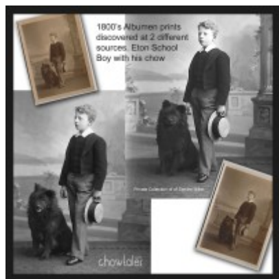
LATE 1800'S Eton Schoolboy and his chow - Rare set...