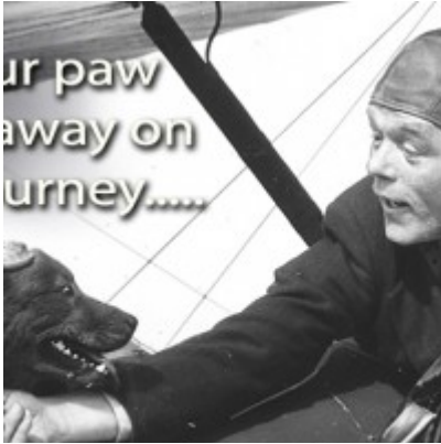
1914 WOMANS CULT OF THE CHOW