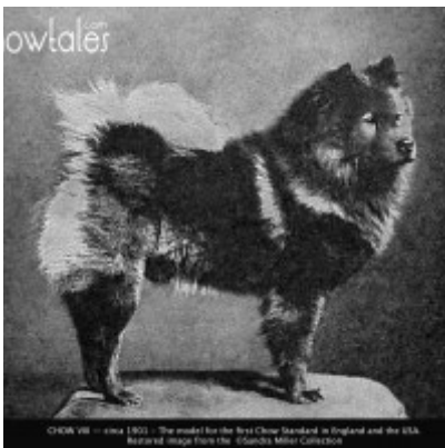
1890 TIME CAPSULE - CHOW VIII - HE SET THE STANDAR...