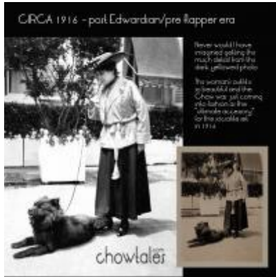
RESTORATION - Circa 1916 Fashionable woman with he...