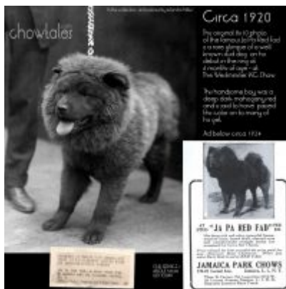
RESTORATION- 1921 Ja Pa Red Fad - 6 months of age ...