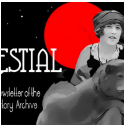
THE CELESTIAL- How the ChowTales Newsletter got it...