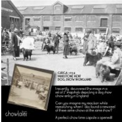
1924 MAIDSTONE KENT ENGLAND CHOW ENTRY - Rare snap...