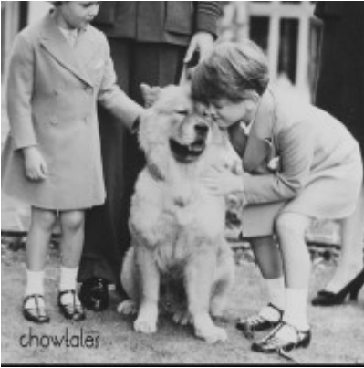
Prince Edward and Princess Alexandra with "Mouff"

1904 - 1973 Chilean poet - Pablo Neruda and his Chow Chu Tah