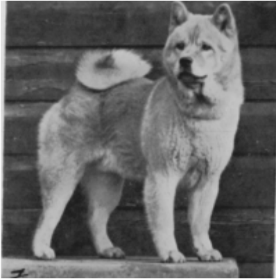
COLLECTION - Smooth Chow Photos from various sourc...

1904 - 1973 Chilean poet - Pablo Neruda and his Chow Chu Tah