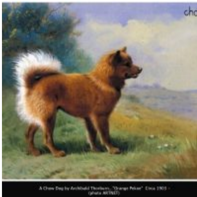
Artist - Archibald Thorburn (1860-1935) Chow pain...