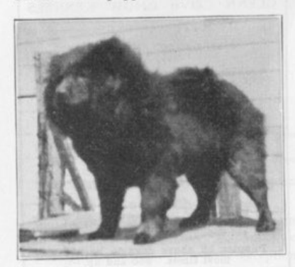
GLENN COVE'S BLUE BIRD Brood Matron owned by Glenn Cove Kennels, Northbrook, Ill.

I do not believe that the breeders of today are paying enough attention to the mother of the puppies they are breeding—