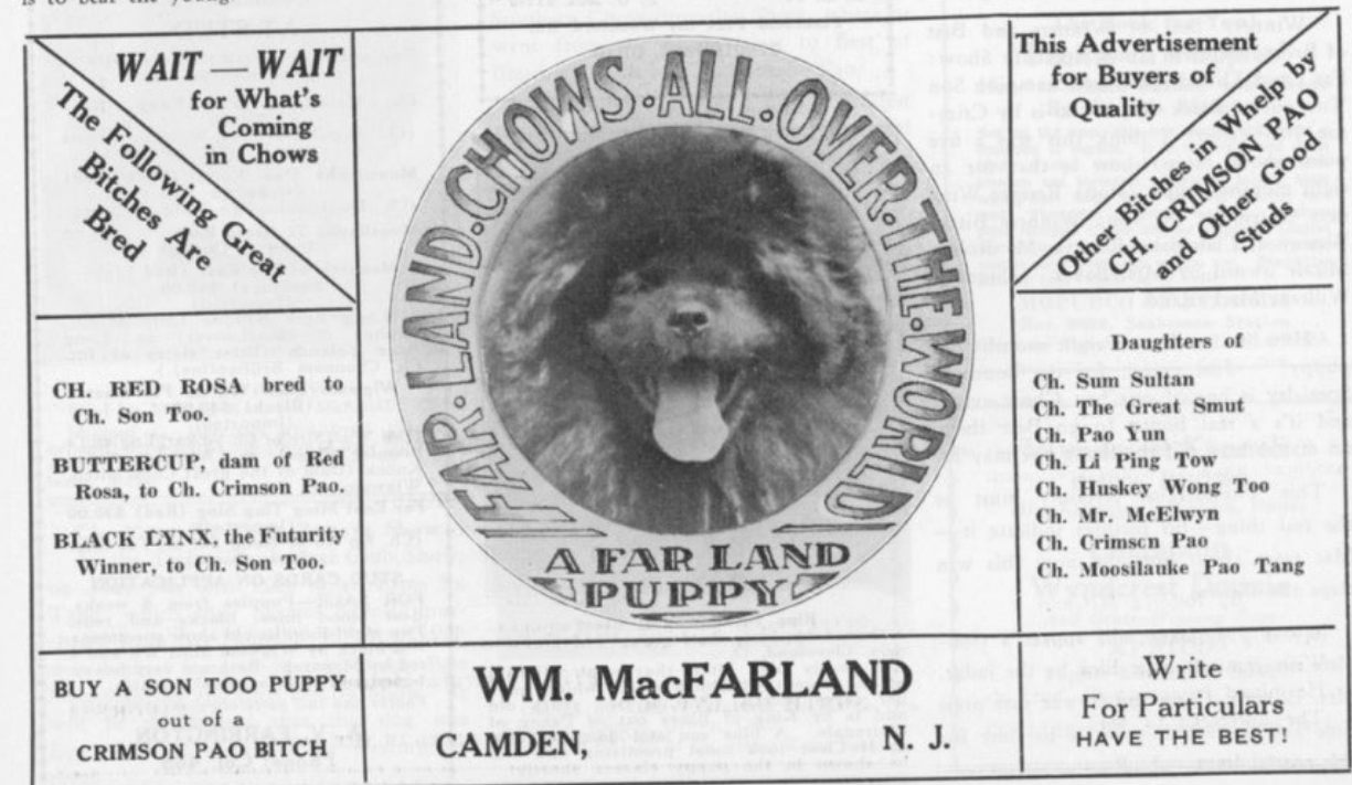
A thing we will appreciate: Mention the DOG NEWS when writing advertisers

ill-nourished, rickety and of most haphazard breeding. Unfortunately, many of them will grow up and be bred and it should be of primary interest to establish breeders to discourage owners from breeding these poorly developed, badly-bred Chows. It may mean turning down a stud fee but in the long run, not only our breed, but you personally, will reap the benefit.