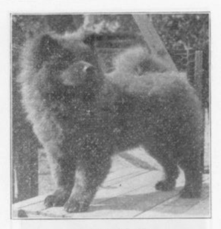
CHUM MEE JR. Owned by X-Quiz-It Kennels, North Hollywood, Calif. Sire: Chum Mee of X-Quiz-It. Dam: Teddy Tai of X-Quiz-It. A fine pup who will no doubt be seen out on the show circuit shortly.