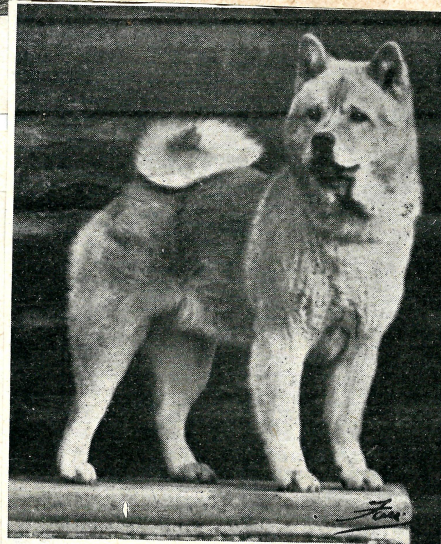
GREAT WESTWOOD VALENTINE.