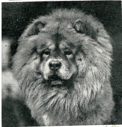
GREAT WESTWOOD HERCULES.