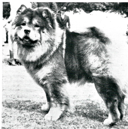
CH. NICLOS MARKSMAN.

A hobby; yes, but what a hobby! Every Chowist