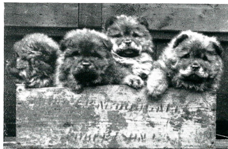
FOUR DONWELL PUPPIES, by CHOONAM CHONG LI ex CHOONAM LAO MO (litter sister to Ch. Choonam Hung Kwong).

Champions need no describing, especially when they are champions which everybody knows. CH. YUNG