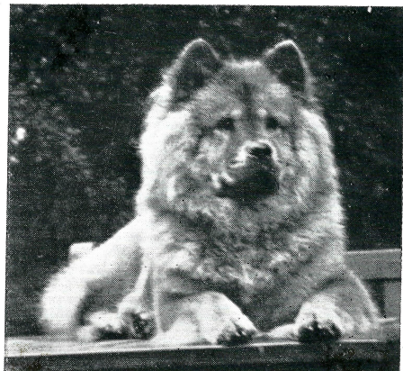
CH. SWEET JEDWORTH.

knows that there are three champions in this kennel. But before it housed that trio of celebrities, the "Donwell" kennel caught my keen attention early last year, when I saw a lovely young dog called DONWELL RED SON OF LENNINGBOY, a real old-type, leonine Chow, a born aristocrat of his breed. A broad skull, naturally tilted ears, a strong jaw finishing a massive headpiece, and a scowl which does not come off, no matter in what position or expression he is caught. And another notable Chow that was at Skelton Grange before the champions went there is CHOONAM LAO MO, who is unique among her sex, for she is the only litter-sister