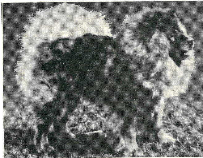
CH. WY WING WA. 1934