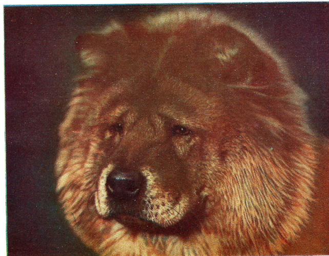
CHOW CHOW. Champion Choonam Brilliantina (Bitch).

FROM "EVERYBODY'S DOG BOOK 1932. (KARSWOOD)