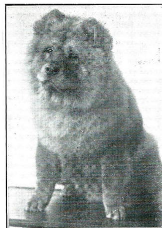
OMAR'S KO SONG.