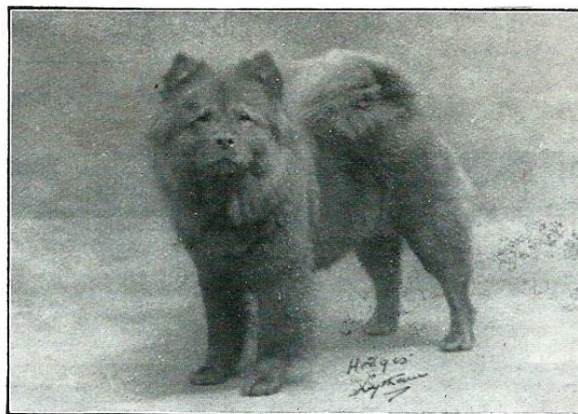
CH. MULFRA MYRTLE.

Of the dogs not already mentioned there is MULFRA BARZIE, by Ch. Hildewell Ba Tang ex Ch. Bunty, and whose wins include the reserve championship at Chester to Ch. Brilliantine. The big-winning MULFRA REDCOAT's sire is Ch. Ba Tang, and his dam is Mulfra Gwennie. MULFRA CANDIDATE is by Magnet out of Mulfra Bluebelle; the latter the lovely blue bitch which died this year. Ch. Ragavarno and Electra are the parents of MULFRA FLASHLIGHT. MULFRA RADIANT, by Mulfra Advance ex Mulfra Fairy, was reserve champion dog at the recent S.K.C. Show. All the particularised "Mulfras" are red, except Baroness, Lady, and Candidate, which are blacks. Some twenty bitches and seven stud dogs, and on not one has mediocrity cast its shadow. Red Judy, first of them all, they do you proud!