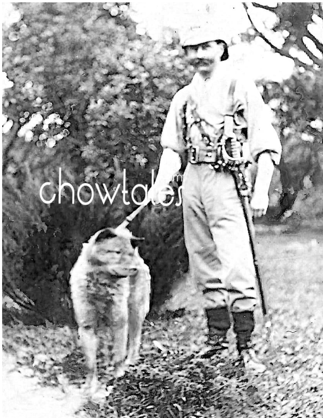
THE PALACE CHOW written on the photo back 1897 Image restored by Sandra Miller The original is in the ©Wendy Saunier Collection