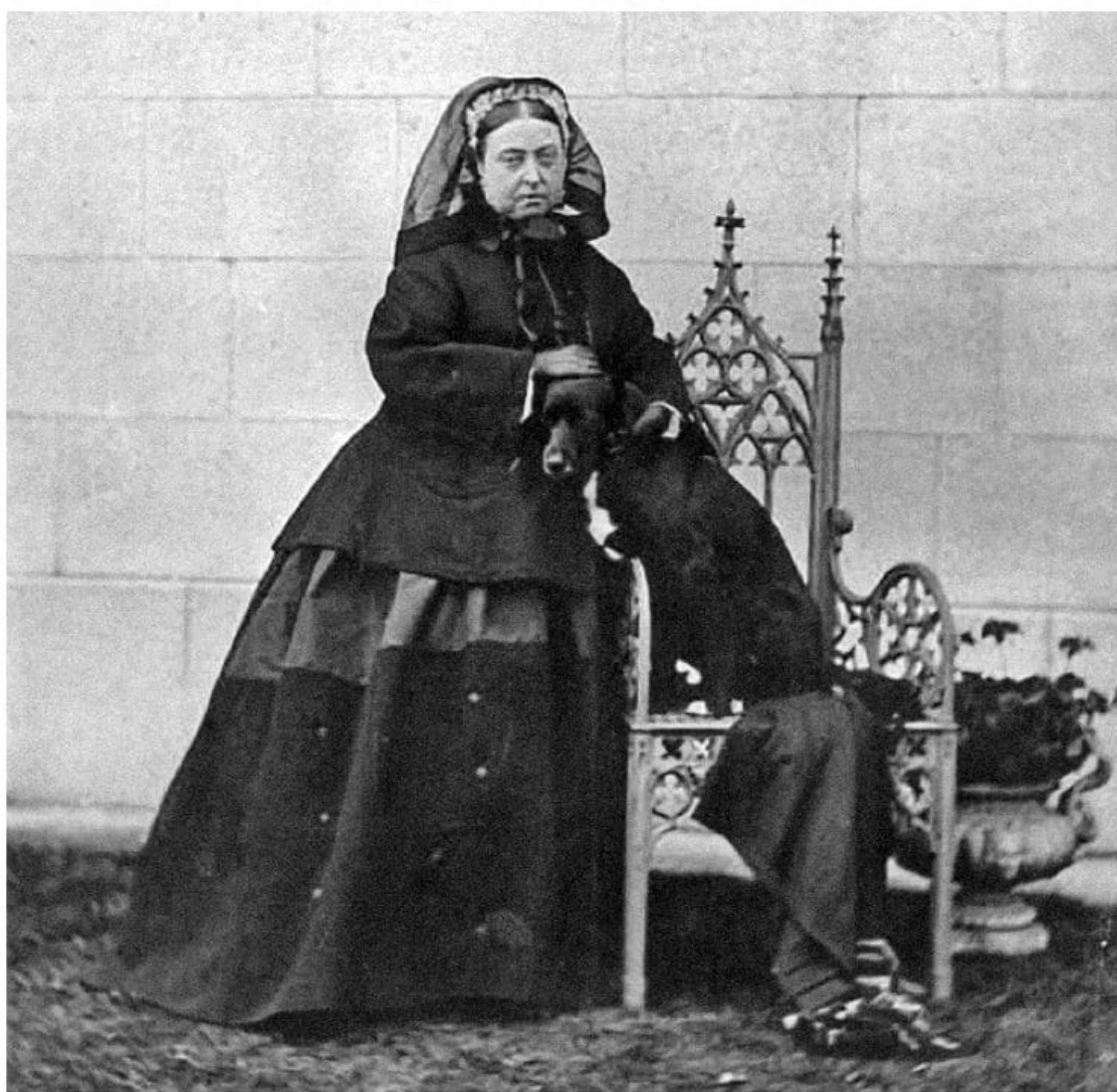
QUEEN VICTORIA AND SHARP THE BORDER COLLIE 1867

BELOW: Queen Victoria had a great passion for dogs and pets of all kinds. There is little information on her chows other than numerous articles referring to several Chows were "housed in London Zoo in the Wild Dog area and in 1865 Queen Victoria was presented with some Chows which were kept in cages at Windsor." Queen Victoria passed in 1901, so if this "Palace Chow" was indeed one of her pets, it would have been late in her life as the photo is dated 1897.