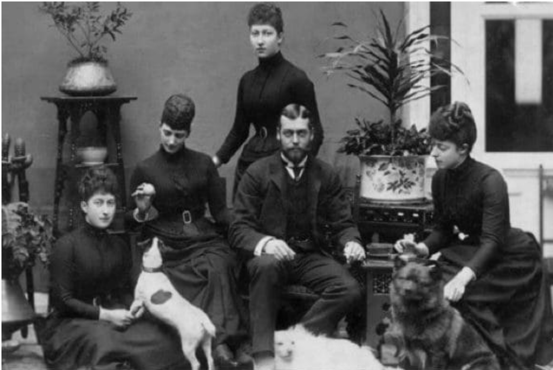
1892 mourning for Prince Albert Victor "Eddy" CLICK PHOTO FOR REST OF PLUMPIE ARTICLE

PALACE CHOW photo is dated 5 years after that. With documentation in my archives of chow lifespans reaching 15 years or more back then, it is a good possibility.