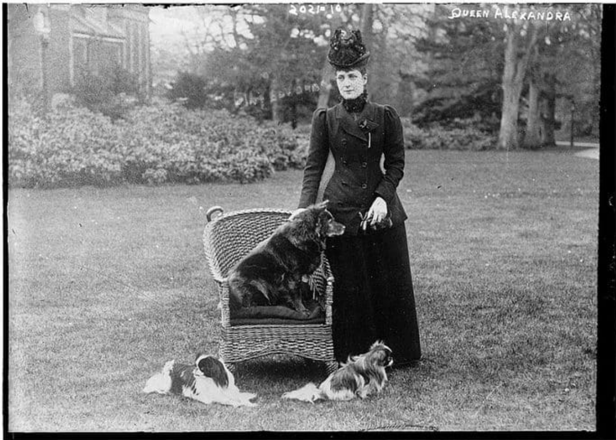
This beautiful image above is of Queen Alexandra of England posing with her dogs which includes "Plumpie" the chow. Circa 1880's-1920. Actual date of photo unknown

CLICK PHOTO TO ACCESS THE FULL ARTICLE I WROTE ABOUT QUEEN ALEXANDRA'S CHOW