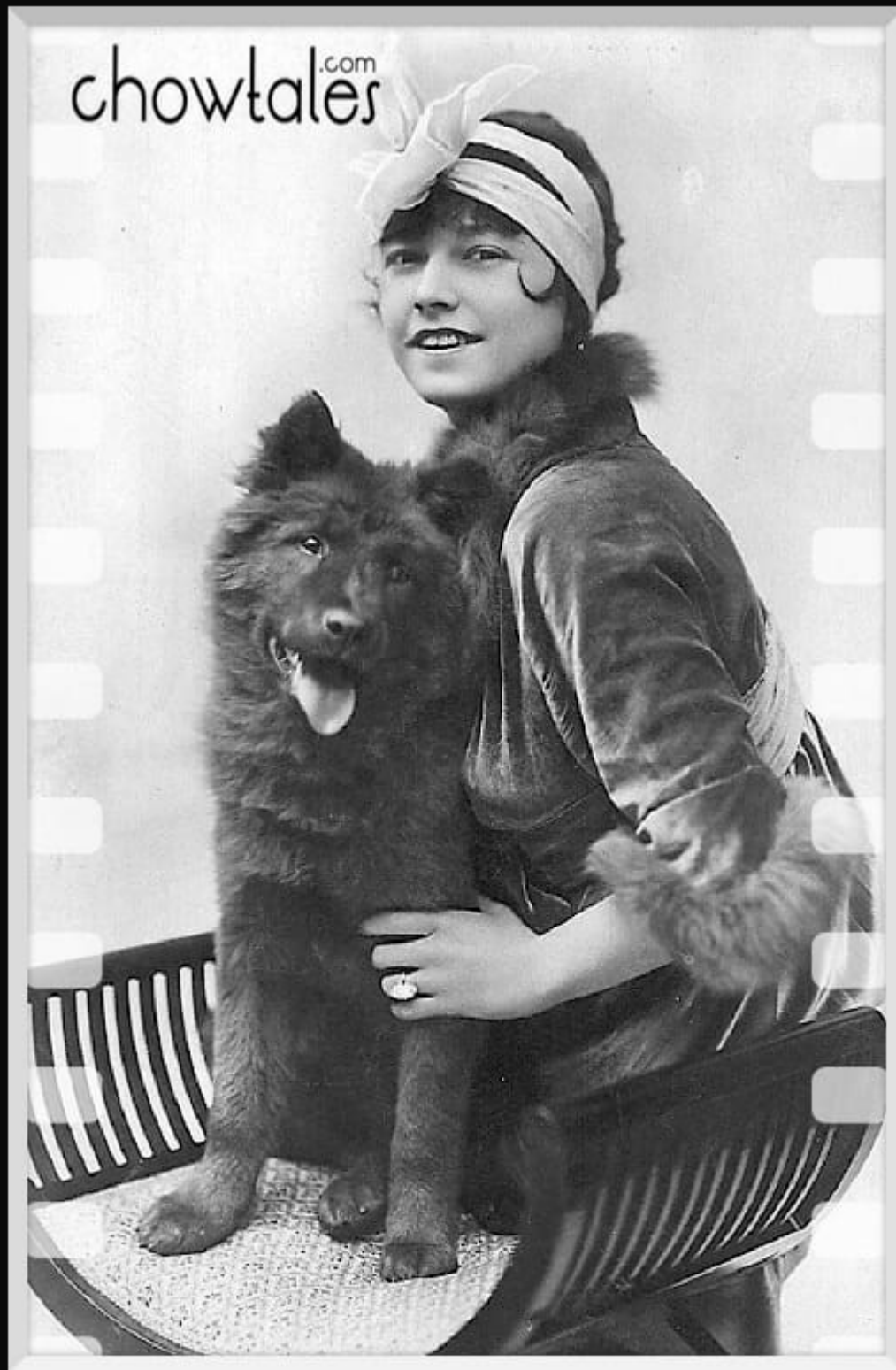
1917 TEDDIE GERARD –SILENT FILM STAR

SOURCE– Teddie Gerard (May 2, 1890 – August 31, 1942) was an Argentine film actress and entertainer of the early 20th