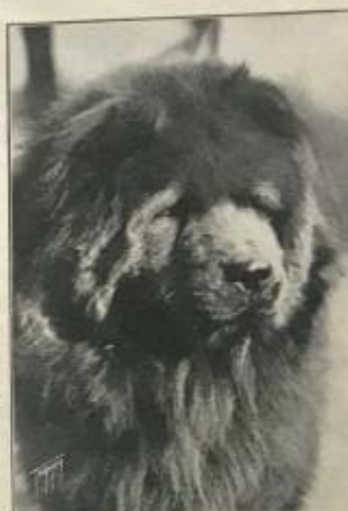
MOOSILAUKE BLUE WING Blue son of Ch. Pao Yun Sixteen months old