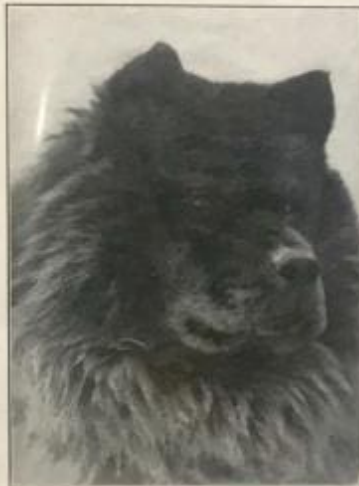
WU LU OF CLAIREDALE

Dogs at stud by Champion Win Sum Min T'sing, Husky Wing Toi and Sum Sultan. All fees $40.00.