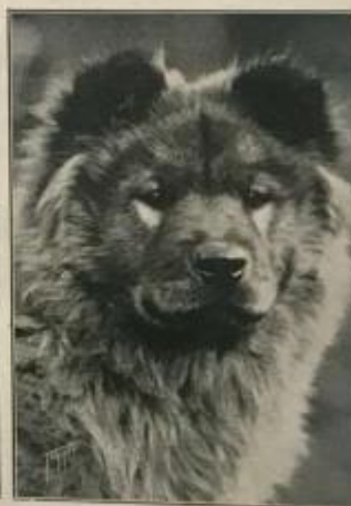
MOOSILAUKE PAO TANG Dark red son of Ch. Pao Yun Six months old