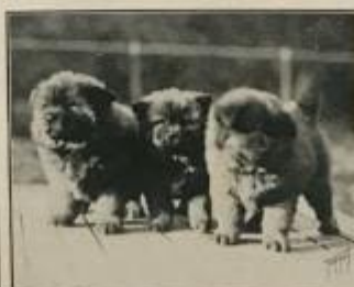
EIGHT WEEKS OLD PUPPIES Male and two females, dark red, by Ch. Pao Yun out of Ch. Little Orb of Tien H'sia