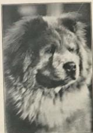
MOOSILAUKE PAO WING Cream son of Ch. Pao Yun Sixteen months old

Summer Home Moosilauke Farms Pike, New Hampshire