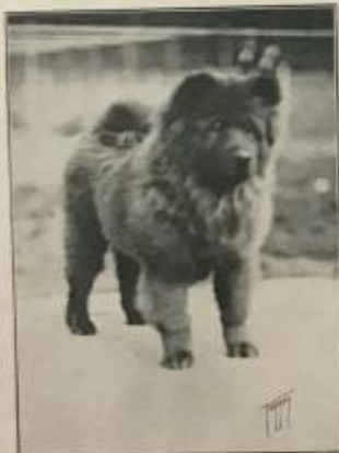
MOOSILAUKE PAO YEN Dark red daughter of Moosilauke Pao Wing. Four months old

Puppies and Grown Stock Frequently For Sale