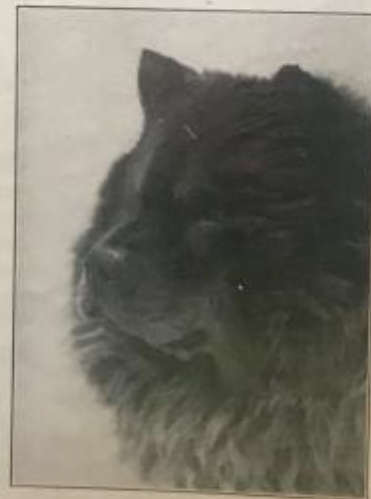
WU LU OF CLAIREDALE