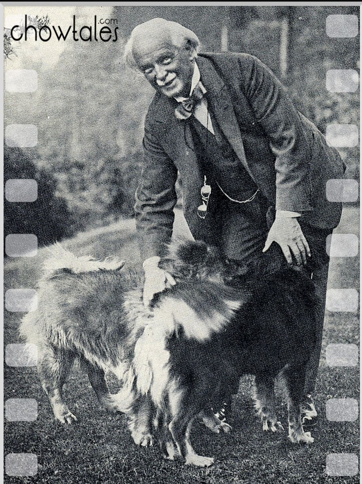
British Primeminister Lloyd George with one of his chows Circa early 1920's

This rare photo of Mr. David Lloyd George came from my copy of