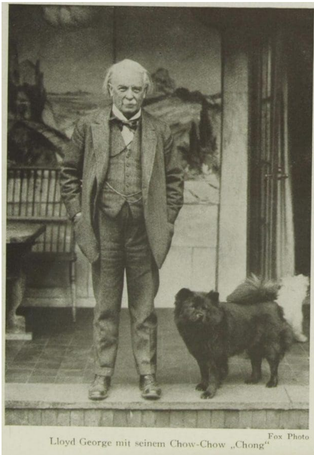
Lloyd George mit seinem Chow-Chow „Chong“

Above is the bookplate before I did some restoration work to bring out the details