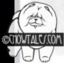
THE CHOWS' BENCH