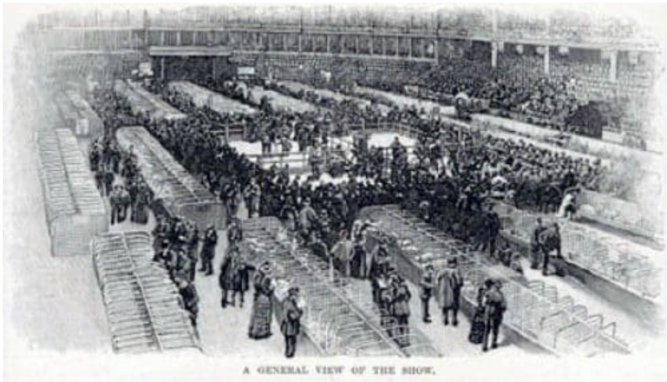
Example of an 1880's benching setup