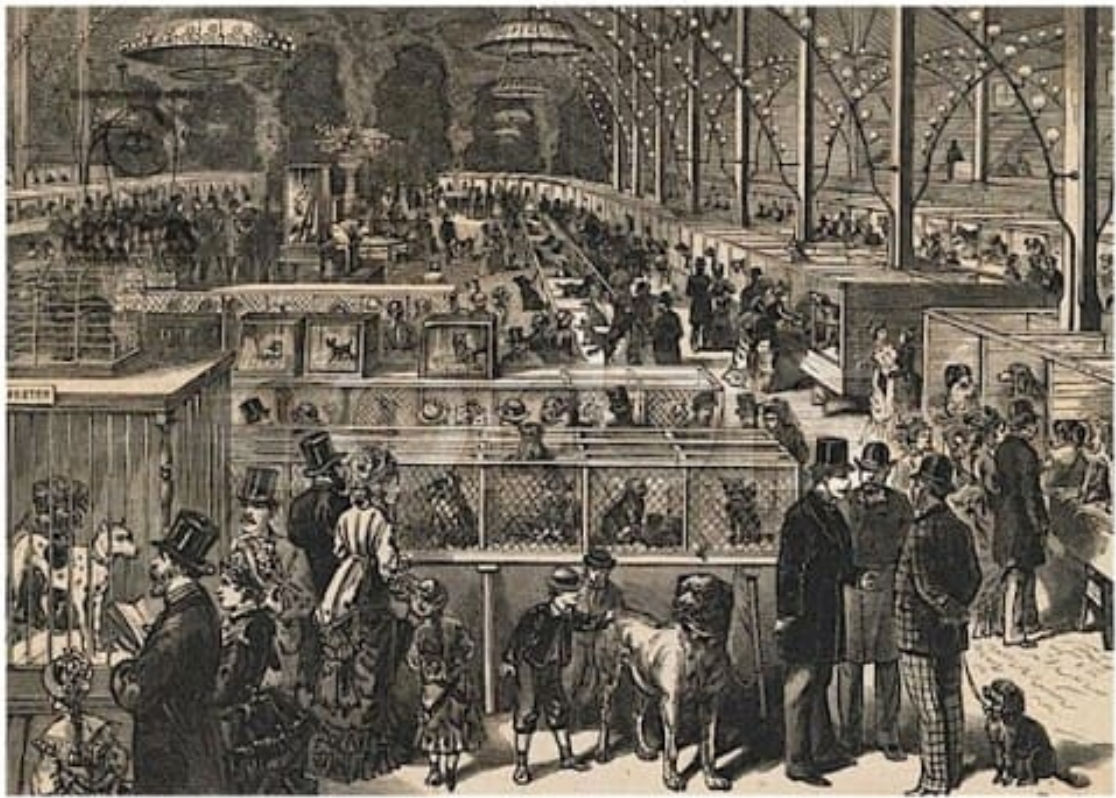
Crufts Benched show 1880