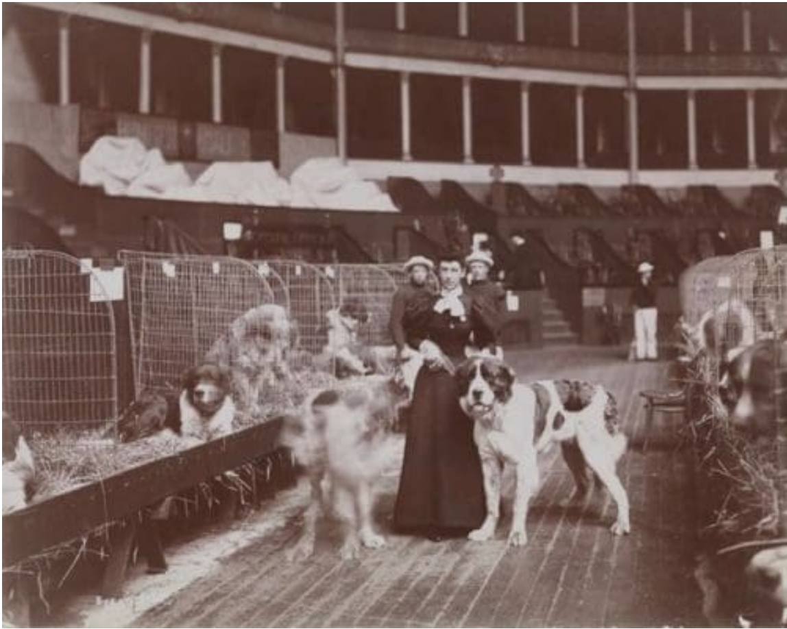
Example of a benching setup

http://www.victorianlondon.org/buildings/crystalpalace.htm