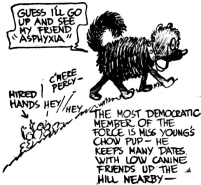
Circa 1919 newspaper cartoon depicting a chow puppy owned by silent film star Clara Kimball Young

Clara would routinely bring her chow onto the film set while she was working.