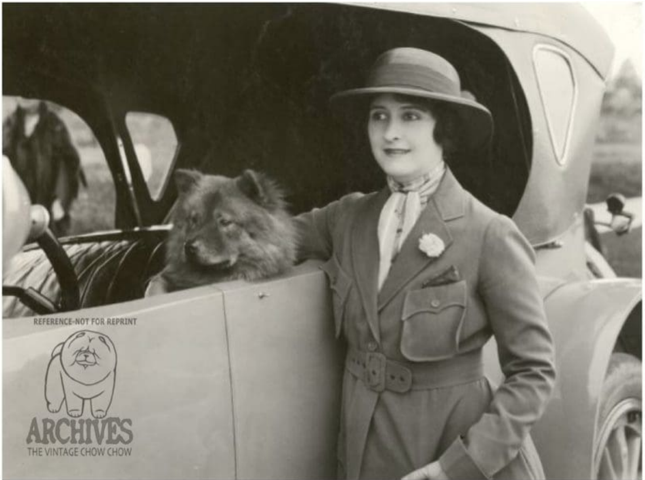
Clara Kimball Young, a silent film actress in an automobile and a Chow Chow Date: 1919 ca. Researching further her chow's name was "Wang" and he accompanied her to the movie studio daily.