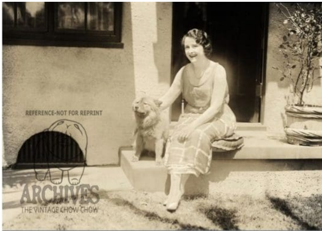
Clara Kimball Young, the first silent film actress and a chow sitting in the sun on the stoop in front of a stucco house. Original caption: "Clara Kimball Young and her prize Chow dog 'Wang.'" Date: 1919 ca.