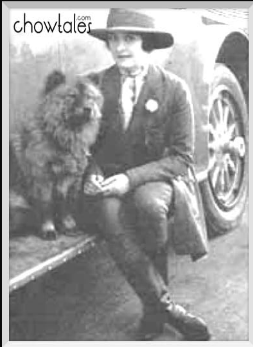
1919 Silent Film Star Clara Kimball Young and her chow "Wang"

written by the interviewer at Clara's studio? Below is Clara's response to her Chow "Wang" being silly with the reporter.