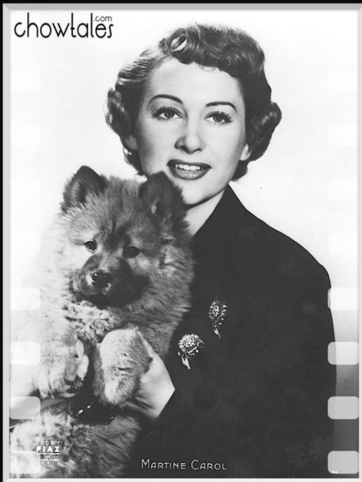
MARTINE CAROL – French actress and sex symbol of the 1950's

This beautiful photo is an original in my personal collection in an 8×10 format. On the back is a French candy advertisement....a first I have seen of its kind...especially for