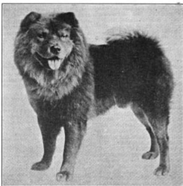
Lord Cholmondeley II

♂ Breed: Chow-chow Born: 05/01/1917 Color: RED