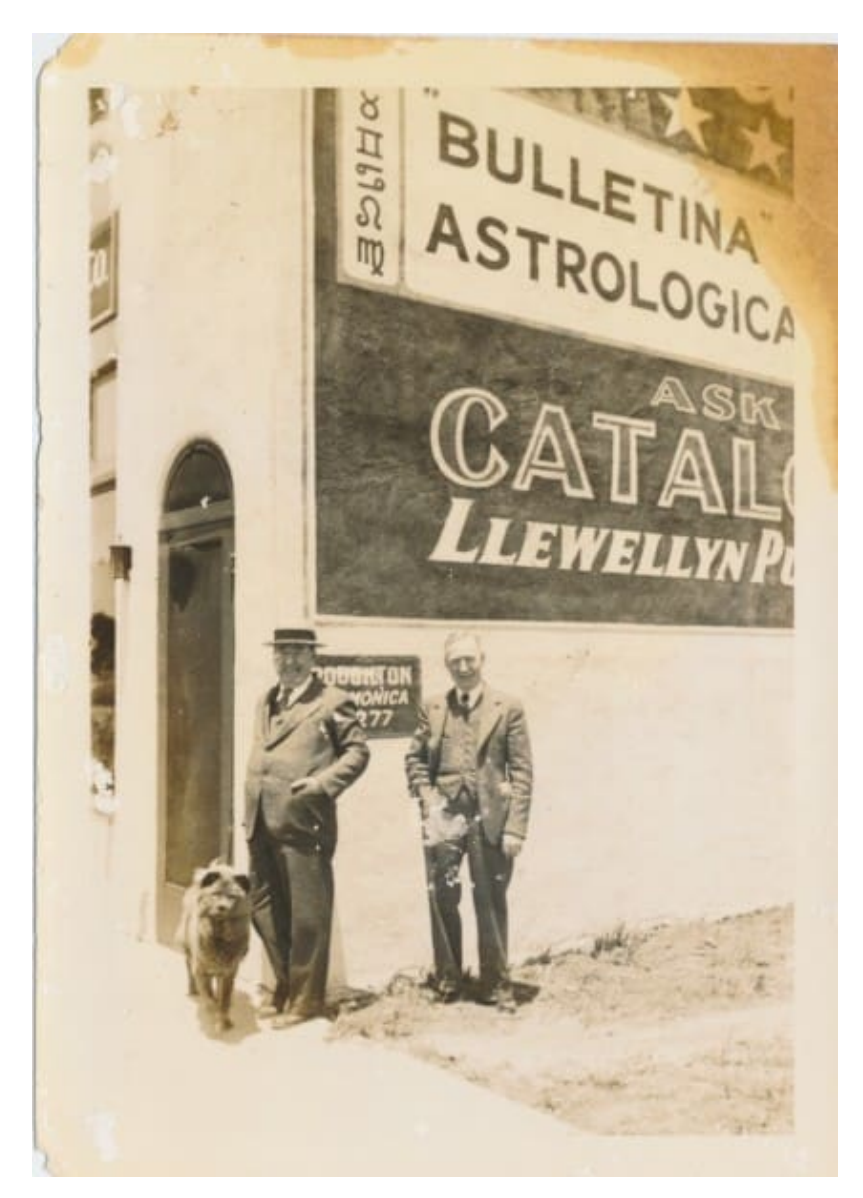
THIS IS HOW THE PHOTO LOOKED AS IT ARRIVED...BEFORE RESTORATION

This is one of those fun unexpected surprises that came a few weeks ago as I was scanning in a few new images from my personal collection. This little 2×3″ photo from the 1920's packed a lot of information in a very small space.