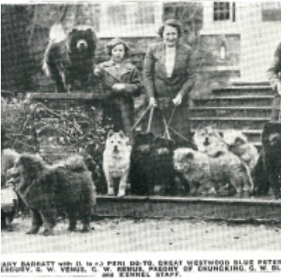
1920s-1950s U.K. Breeders with their chows from ma...