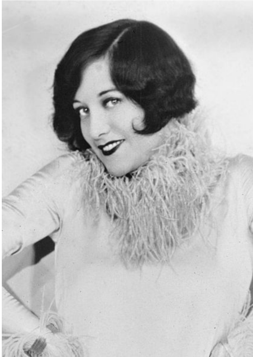
JOAN CRAWFORD 1927

In 1955, she became involved with the Pepsi-Cola Company through her marriage to company Chairman Alfred Steele. After his death in 1959, Crawford was elected to fill his vacancy on the board of directors but was forcibly retired in 1973. She continued acting in film and television regularly through the 1960s, when her performances became fewer; after the release of the British horror film Trog in 1970, Crawford retired from the screen. Following