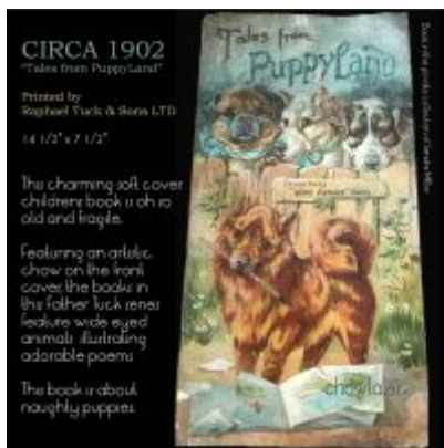
BOOK- 1902 Childrens book -Tales from PuppyLand