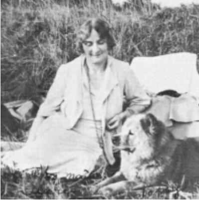
Princess Marie Bonaparte and TOPSY The Story of a ...

Jackie Coogan child actor with chow Sing Song