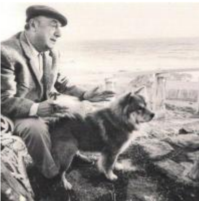
1904 - 1973 Chilean poet - Pablo Neruda and his C...