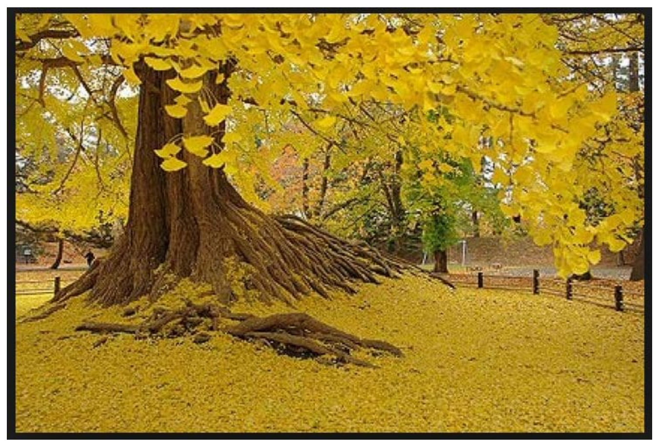
THE BREATHTAKING GOLDEN YELLOW COLORATION OF THE GINKGO IN THE

Each image will be showcased in this Ginkgo theme in black and sepia…each will be unique and slightly different depending on the size and subject of the photo.