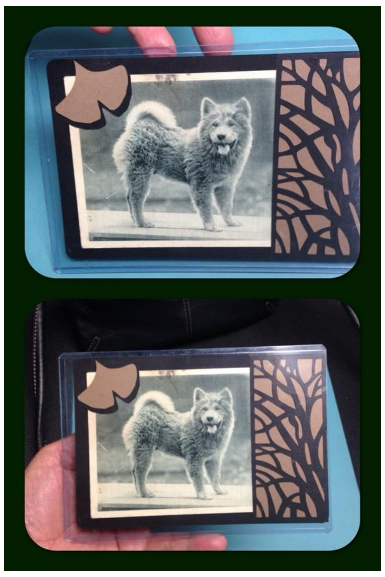
AN EXAMPLE OF HOW I AM ARCHIVING MY PERSONAL CHOW PHOTO COLLECTION