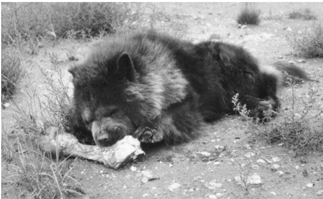
All I can see is this chow stealing one of Georgia's painting props-