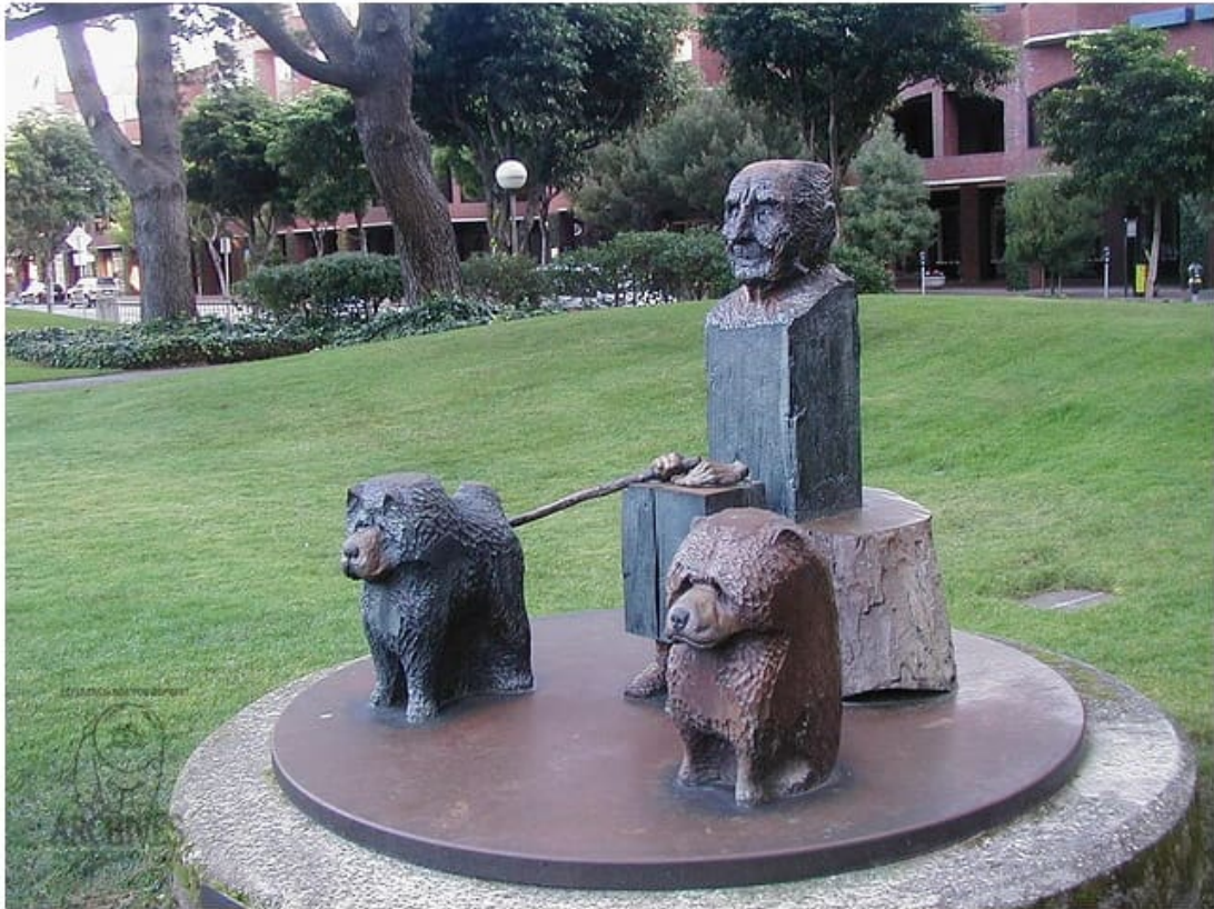
Another view of the Marisol sculpture Georgia O'Keefe and her chows