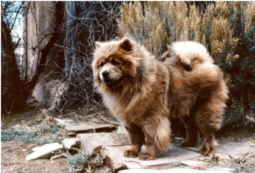
Georgia O'Keeffe's red chow...possibly Jingo who died shortly before she did. Photo was taken after 1972 –