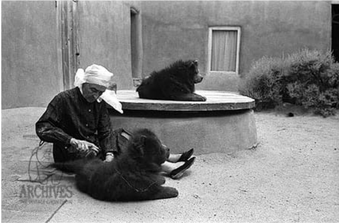
Georgia O'Keeffe Grooms her Dogs

size. By painting enormous, vibrantly hued flowers, the art conveyed O'Keeffe's wonderment at nature by removing the subjects from any recognizable context and transforming their organic forms into powerful abstracts.