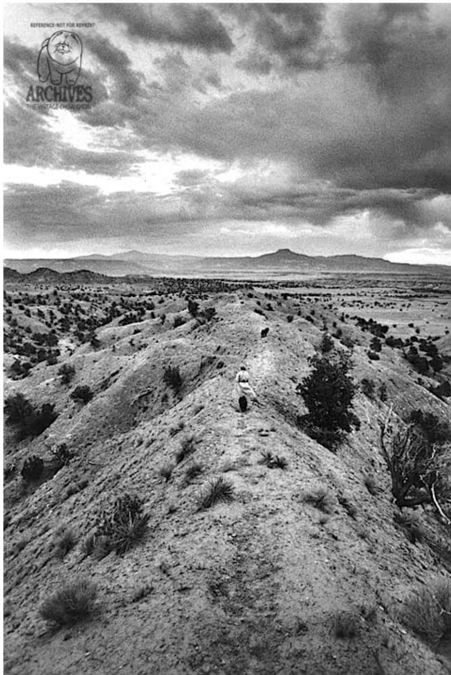
Georgia O'Keeffe on Evening Walk with her Dog, Ghost Ranch, This is another masterfully photographed scene of the artist on an outing with her chow