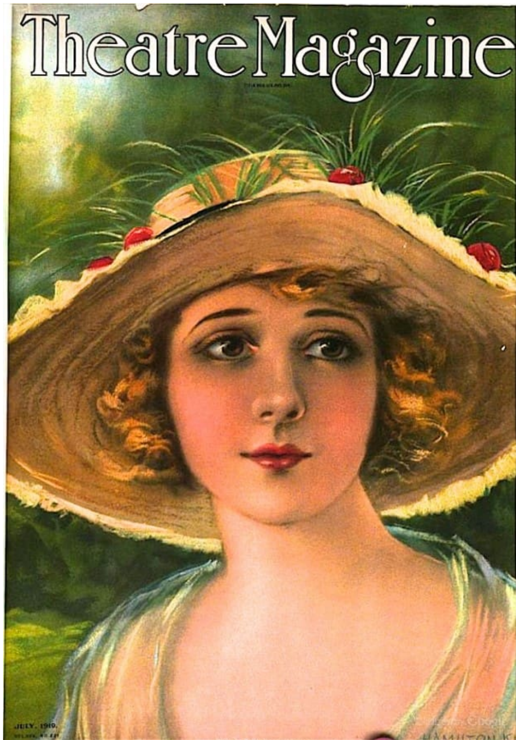
EVELYN GREELEY , 1919 THEATRE MAGAZINE