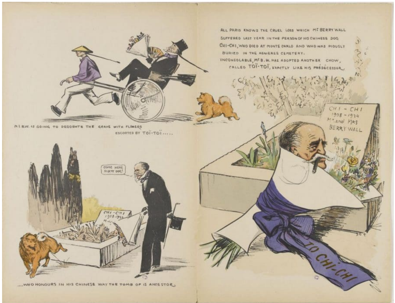
In the Musée Carnavalet, Histoire de Paris Collection