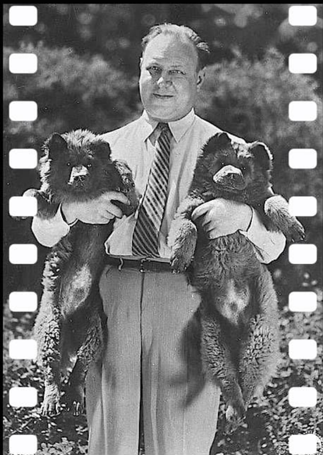
1920 EMIL JANNINGS WITH PUPS STAGE AND SCREEN