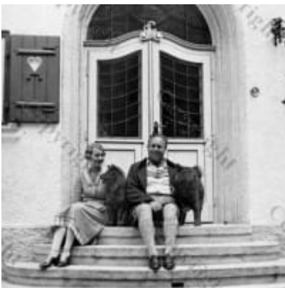
PHOTO SOURCE FOR THE 5 IMAGES BELOW...CLICK HERE TO SEE IMAGES LARGER AT THE PALLAS WEBSITE