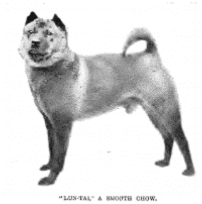
1903 "Lun Tai"- England