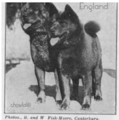
1925 Father & Daughter – England