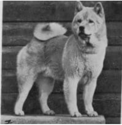
1942 Great Westwood Valentine – England