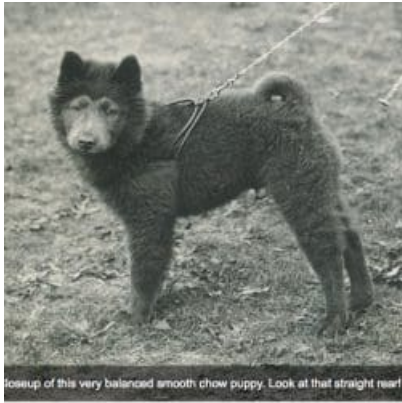
1920s smooth chow puppy – USA