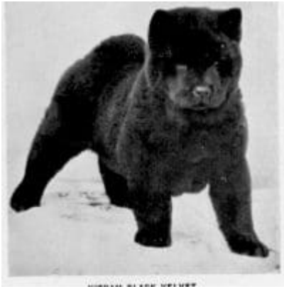
1948 Smooth Black-England