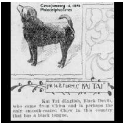
1898 "Kai Tai" Smooth – America