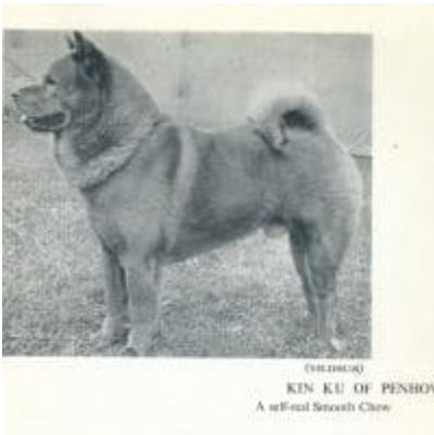
1959 Book Plate- Collett- Smooth Kin Ku of Penhow