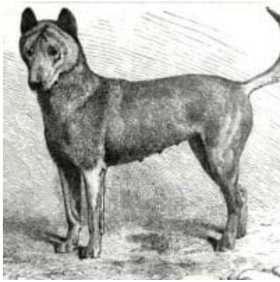
1879 "Chinese Puzzle"-England