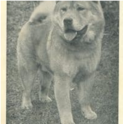
1954-Smooth -Book The Popular Chow