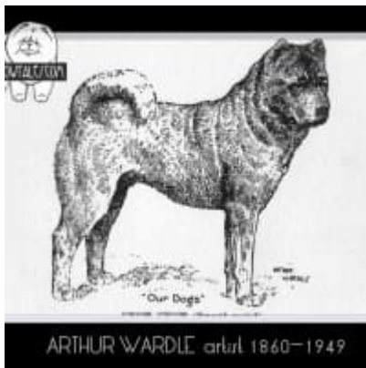
1912 Bookplate etching