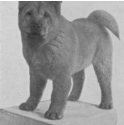
1945 Smooth Puppy-England