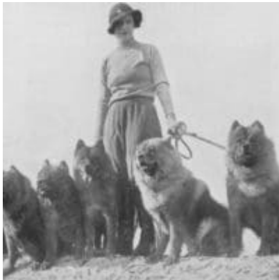
1934 Smooth to the left – England