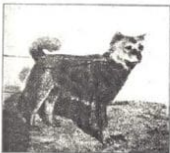
Fig. 24. Chow-Chow. 1. og Erespræstle Odense. Grevinde El. Moltke, Tryggevælde.