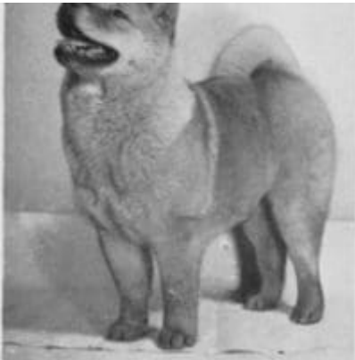
1945 Smooth Puppy-England