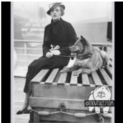
1934 – Smooth – America