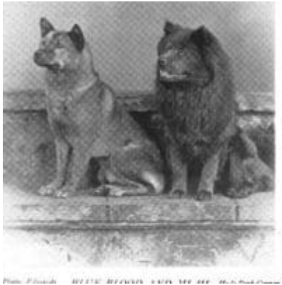
1897 "Mi Hi" (left) with "Blue Blood" – England