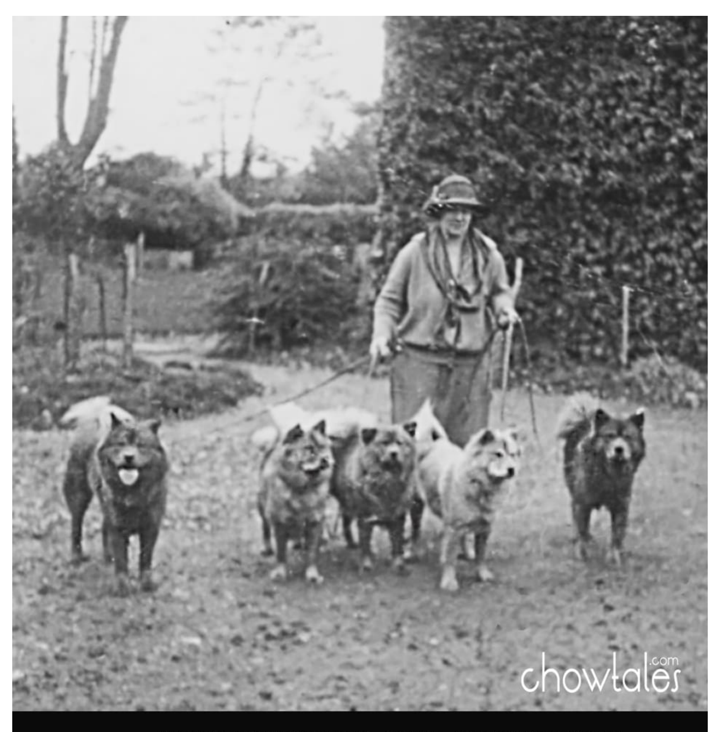
Restored image 1920's England