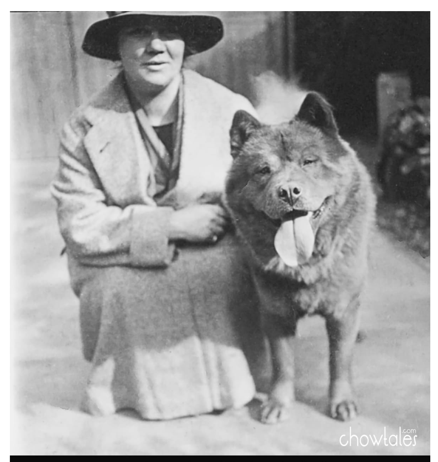
Restored image 1920's England

THE 3 PHOTOS BELOW ARE OF MRS. WAGSTAFF IN THE MID 1920's-early 1930s. USE FOR COMPARISON. NOTE THE DIMPLES, NOSE, MOUTH AND EYE PLACEMENT ARE VERY MUCH THE SAME AS THE WOMAN IN THE ENGLAND SNAPSHOTS. CLICK THUMBNAILS TO SEE LARGER