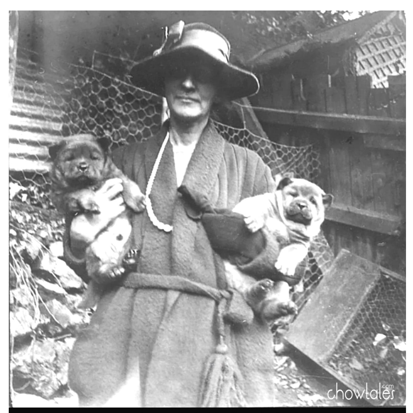
Restored image 1920's England