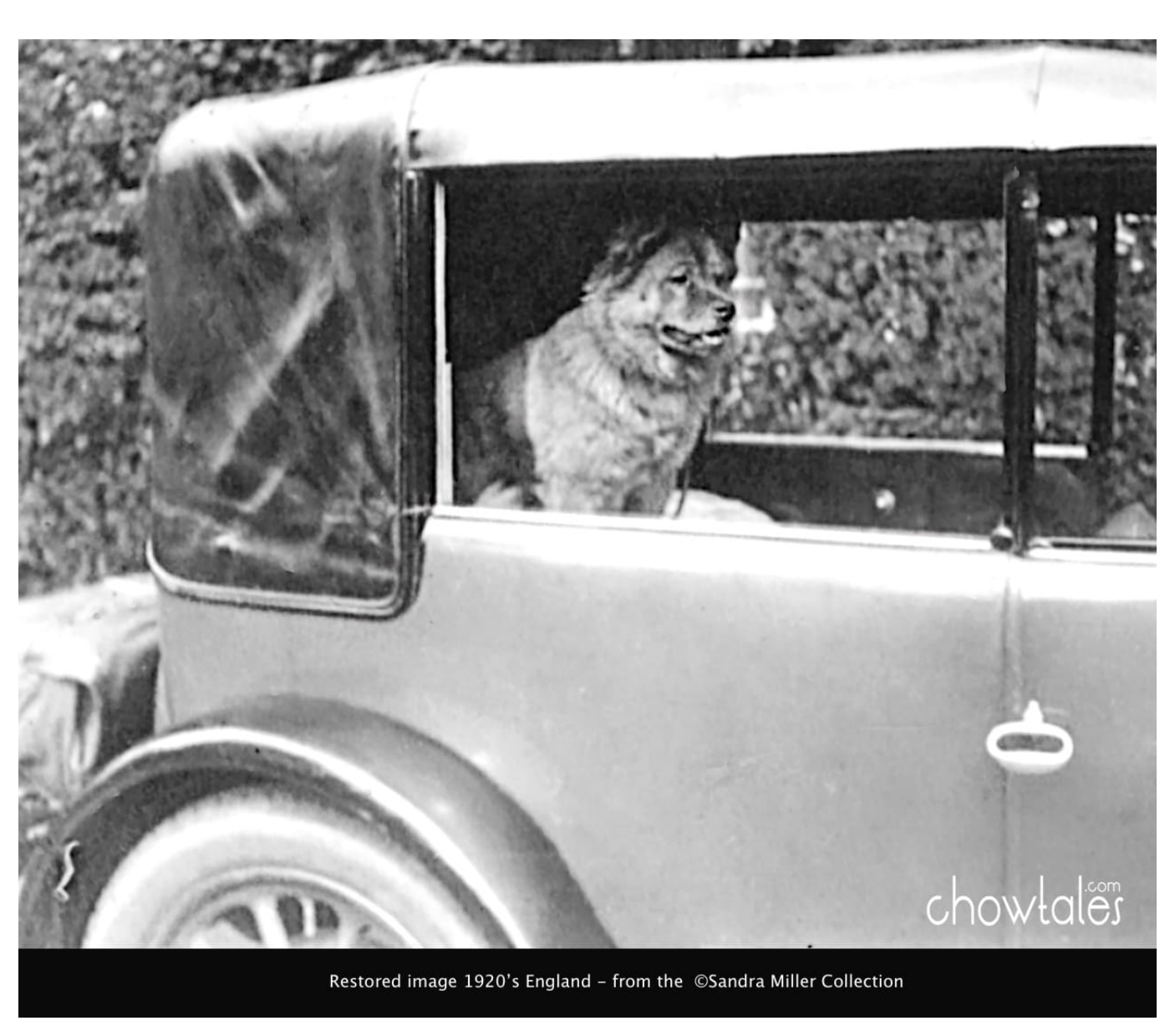
YES...another Chow with Car image for my Curated Collection