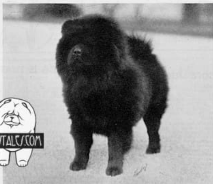
CH. FAR LAND THUNDERSTORM

Ch. Far Land Thunderstorm has been selected to illustrate the official Chow