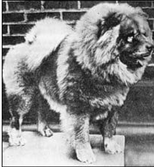
CH.YANG FU KING WAS CH.YANG FU TANG’S SIRE