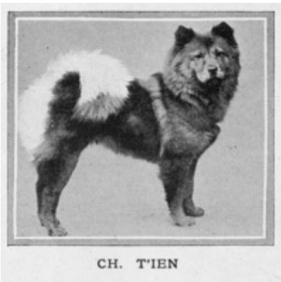
1895 TIMECAPSULE - CH. T' IEN - History's first re...