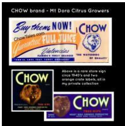
CHOW BRAND Mt. Dora Fruit growers - Crate Labels a...