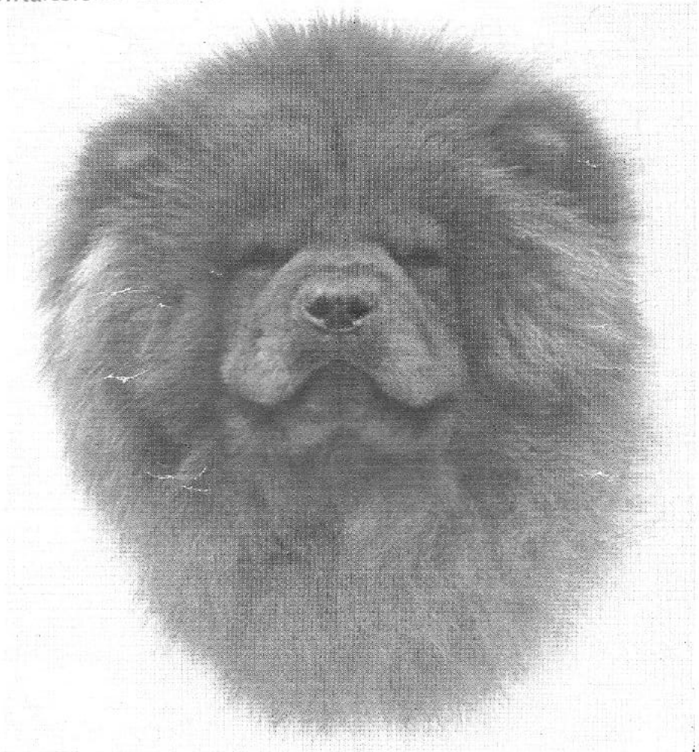
CH. HO HAN BEAUTIFUL 1941 CHOW NATIONAL BEST OF BREED