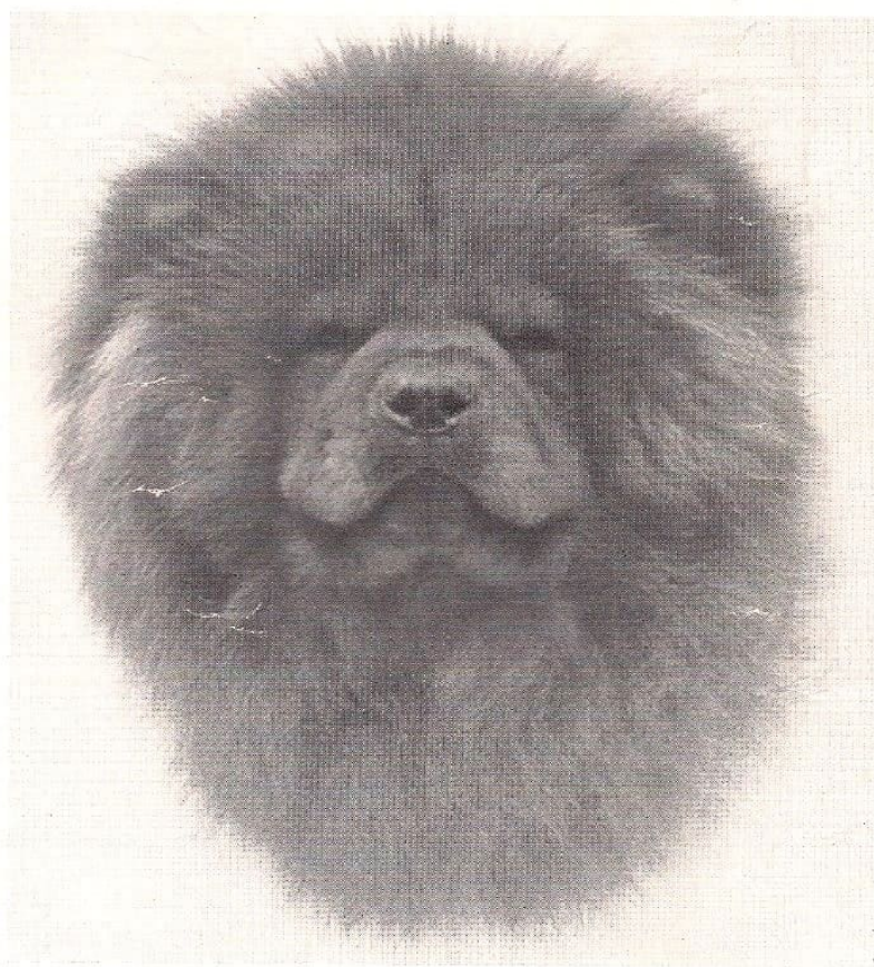
The Chow Chow CHAMPION HO HAN BEAUTIFUL