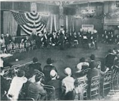
and Boltes Co., New York; JUDGING BEST IN SHOW AT THE CHOW CHOW CLUB' WALDORF ASTORIA, NEW YORK, U.S.A.