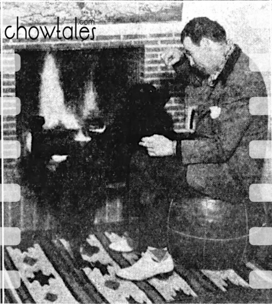
Preston Foster, screen actor, is never too busy to play with his black chow, Ching, who doesn't care for many persons other than his master. Ching is often Preston's sole companion on trips aboard his cruiser, Zoa III.

June 26 1937 Actor Preston Foster and Ching