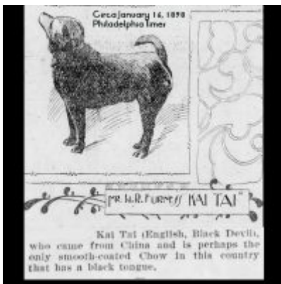
1898 Kai Tai - A very early smooth chow in Philade...