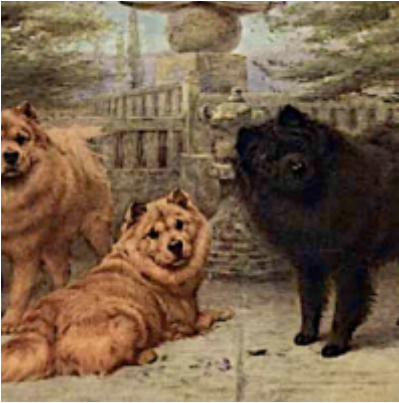
MAUD ALICE EARL CHOW PORTRAITS