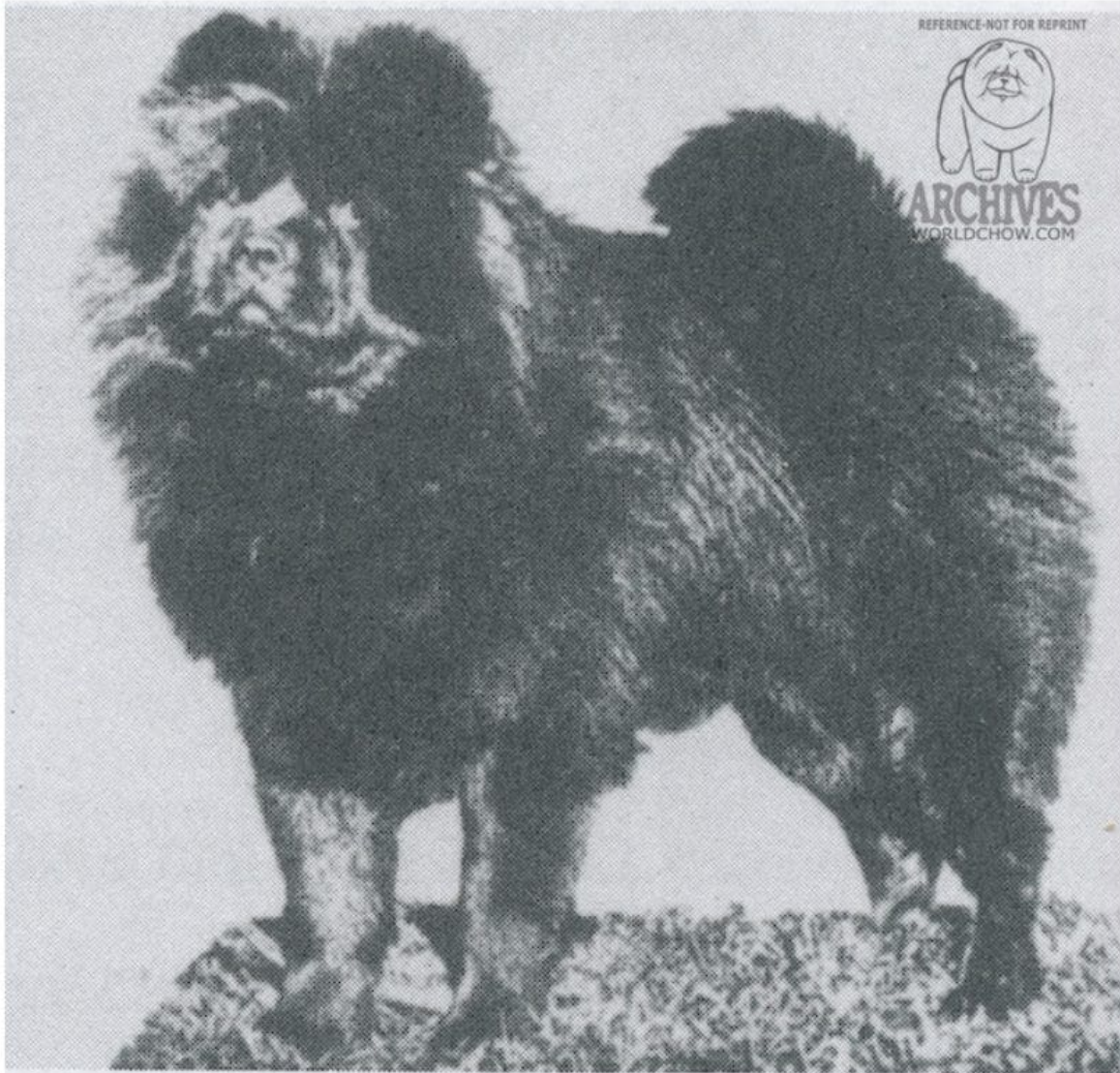
Ch. Farland Thundergust, by Ch. Clairedale Son Too.