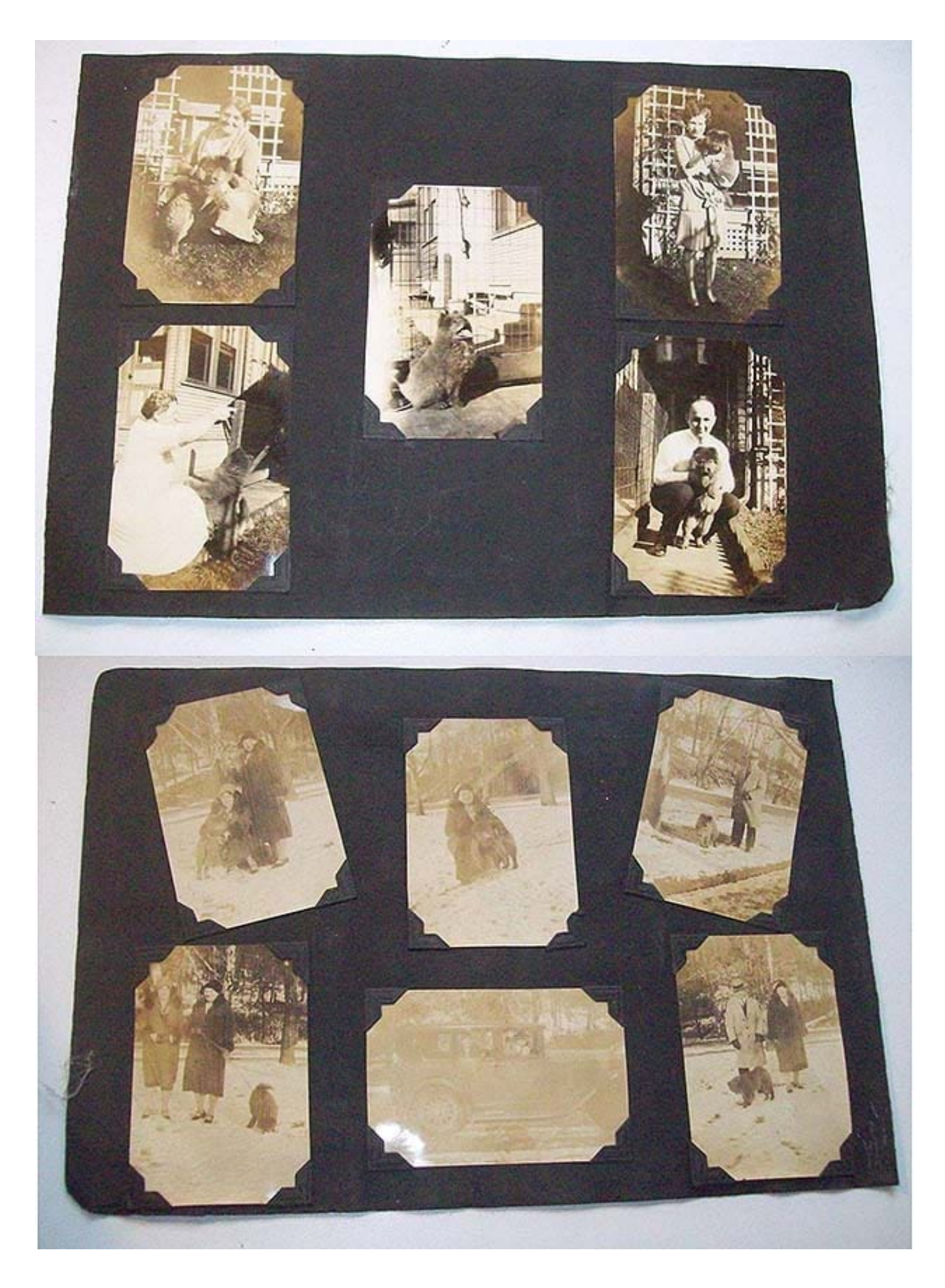
I'm always amazed at the exciting things I find when I acquire