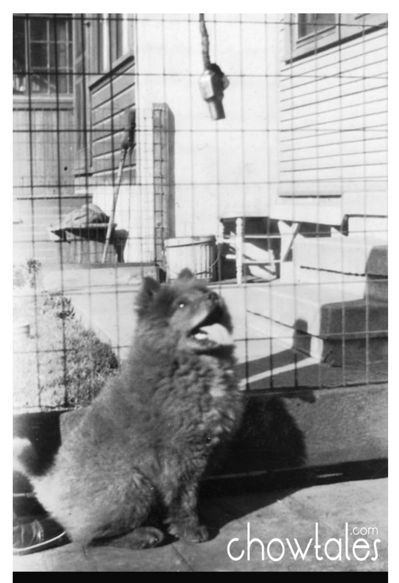
Restored 1930 image