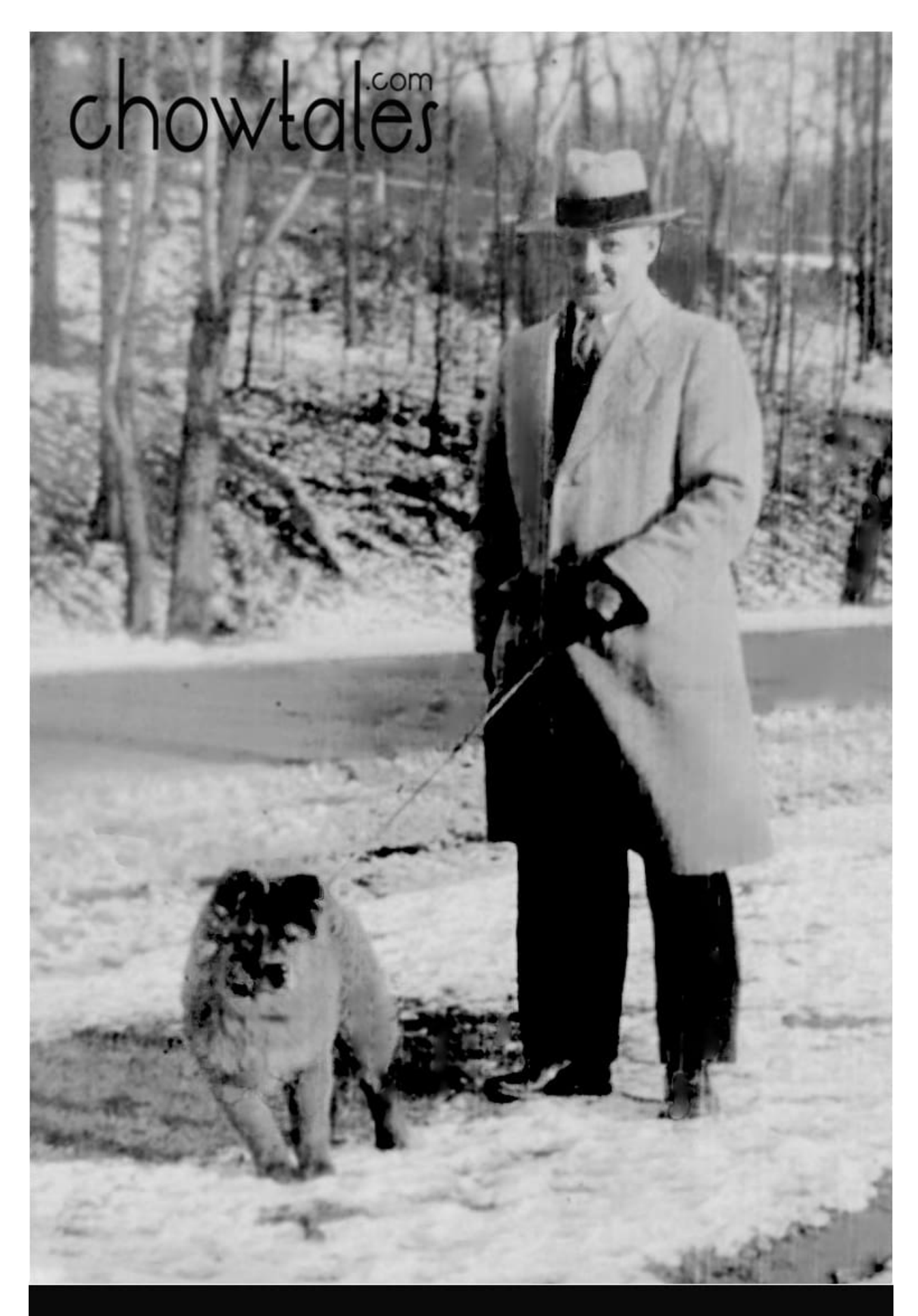
Restored 1930's image from the ©Sandra Miller Collection