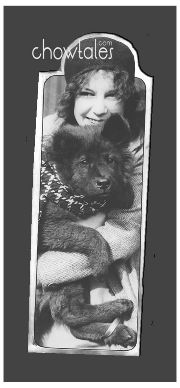
In the private collection of Sandra Miller ©2017

This is most likely what it would have looked like in print ....with text added around it of course