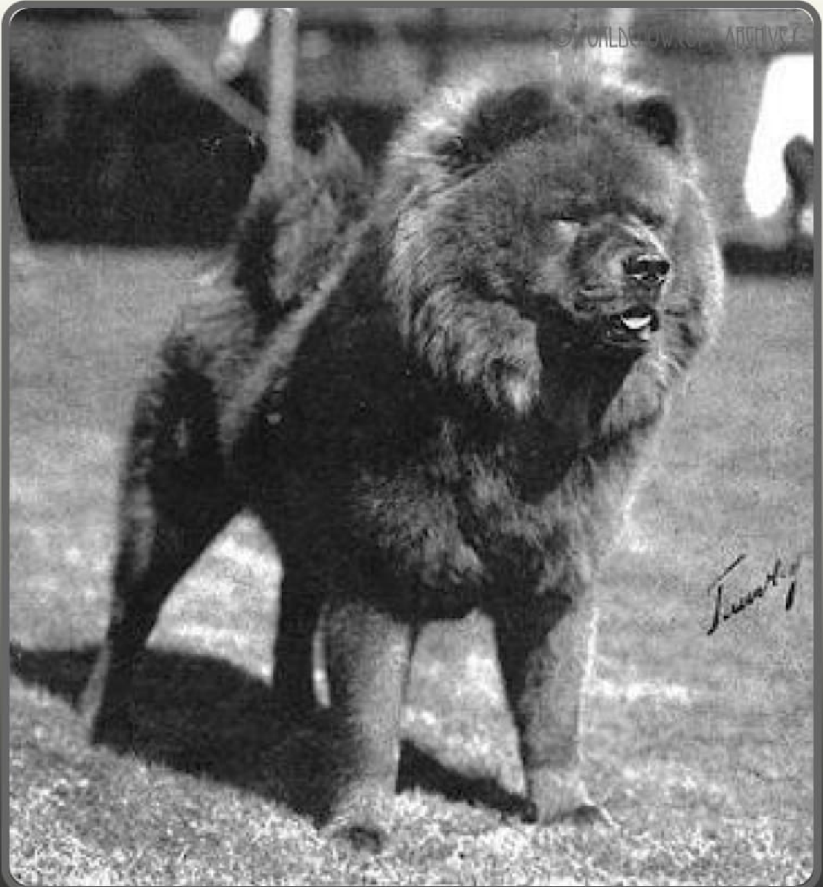
CH. CLAIREDALE SON TOO 1930 CHOW NATIONAL BEST OF BREED

Below: Clairedale Son Too entered in the 6-12 Month Puppy dog class later went on to become the 1930 National Specialty Winner