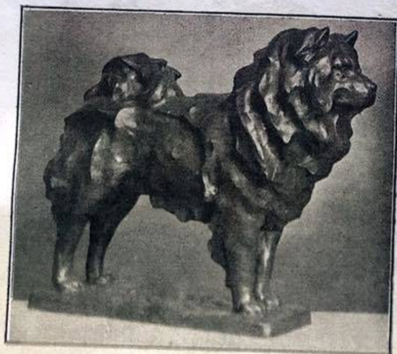
CHOW BREEDERS' TROPHY