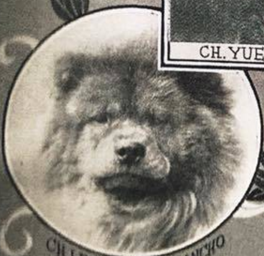
CH. LEDGELAND'S SANCHO