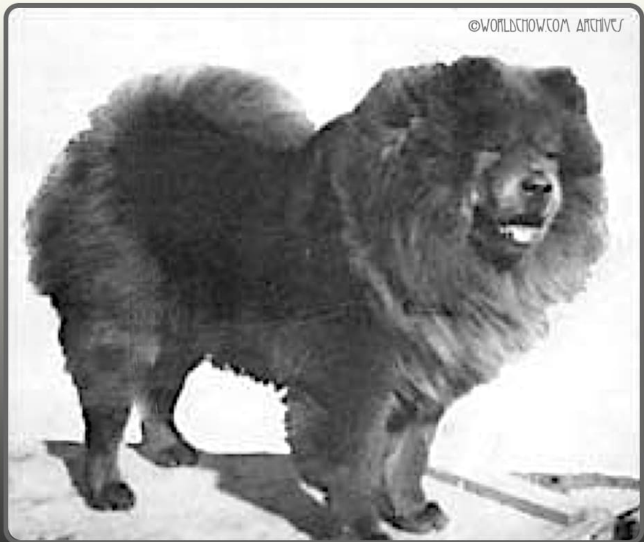
CH. SON OF MIN T'SING 1928 CHOW NATIONAL BEST OF BREED

of Breed winner at this 1928 Specialty. He was one of the top winners in the history of our breed as well as being one of the 5 foundation sires in America. This dog is behind many of our chow's pedigrees of today.