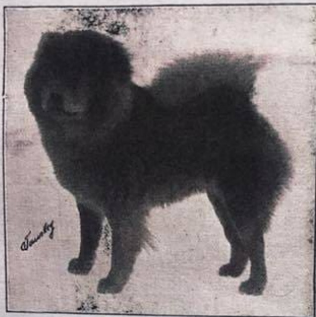
Champion Ledgelands' Winnie of Tien H'sia