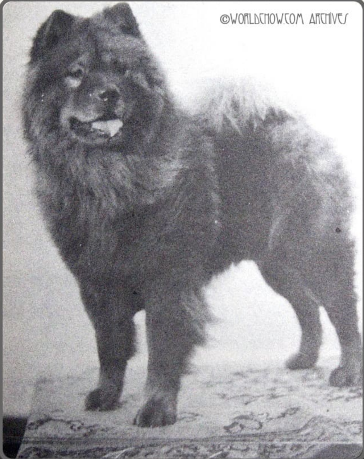
CH. WENDI LOO SUNLEIGH 1927 CHOW NATIONAL BEST OF BREED