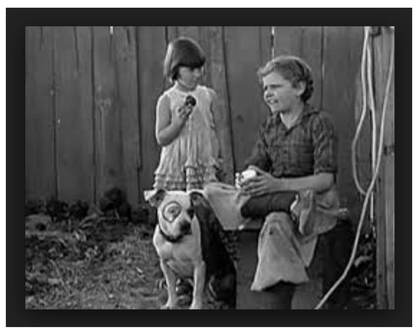
LEON JANNEY IN THE LITTLE RASCALS 1930 FILM "THE BEAR SHOOTERS" CLICK PHOTO TO WATCH THIS CHARMING FILM