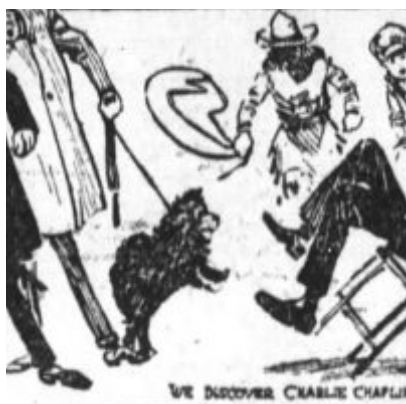
1916 Charlie Chaplin - Chow tracks down silent mov...