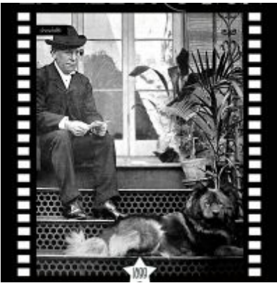
1899 LIONEL BROUGH - British actor and comedian wi...