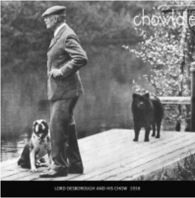
Lord Desborough with a Chow 1938