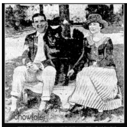
1922 Gentleman Jim Corbett heavyweight champion an...