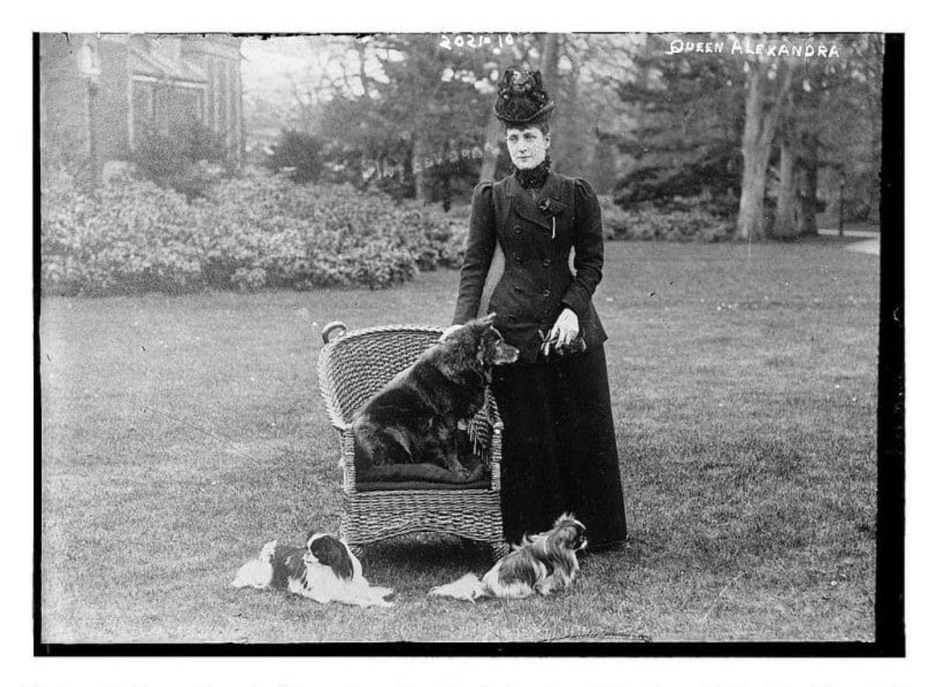
This beautiful image above is of Queen Alexandra of England posing with her dogs which includes "Plumpie" the chow. Circa 1880's-1920. Actual date of photo unknown

Also, see my archive entry about the PALACE CHOW...see photo below and <u>CLICK HERE</u> to read more