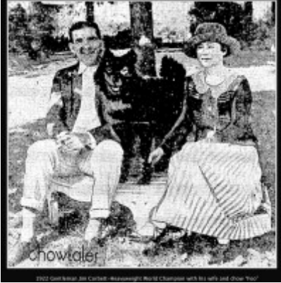
1922 Gentleman Jim Corbett heavyweight champion an...