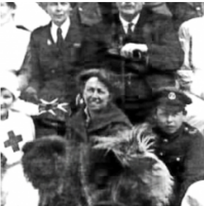
Circa 1915-1917 Eleanor Roosevelt - WWI Nurses an...