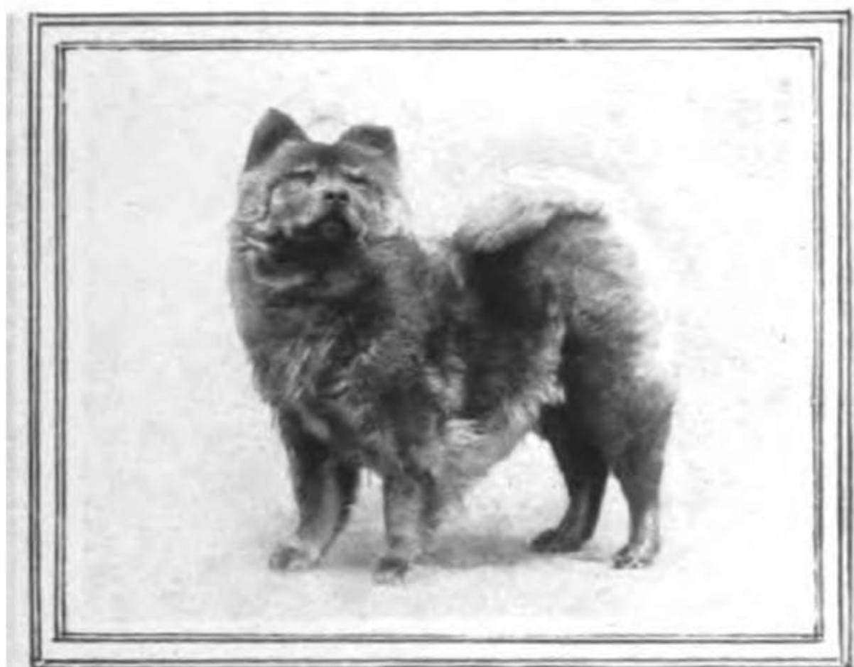
MISS LAWTON'S CH "SHOO SHAN".