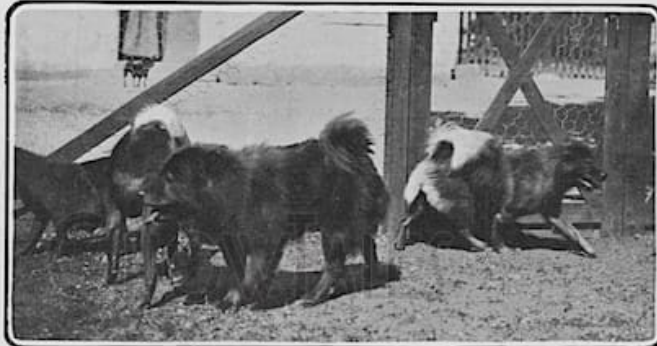
CHAMPION SHYLOCK, CHAMPION HAIPHONG CAMBODGE, GENERAL KUROPATKIN, AND RED CHINA IN THEIR KENNEL

Mr. Morgan thinks the same amount invested in sound American securities would produce 4 per cent., thus increasing the Pope's annual income by £100,000 from this source alone. His Holiness thanked Mr. Morgan for his suggestions and promptly ordered a report from his treasurer on the Vatican's investments, which are undoubtedly managed in a most old-fashioned way. In this case it is clear that the children of this world are wiser than the children of light.