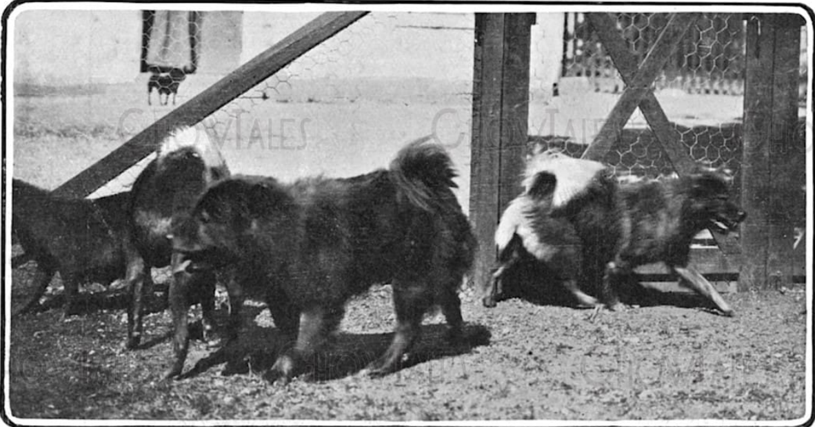
CHAMPION SHYLOCK, CHAMPION HAIPHONG CAMBODGE, GENERAL KUROPATKIN, AND RED CHINA IN THEIR KENNEL