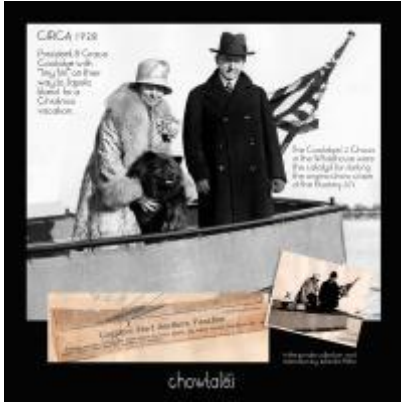
RESTORATION- 1928 President Calvin and Grace Coolidge...