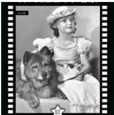
1937 TRAUDL STARK - Austrian born child actress wi...