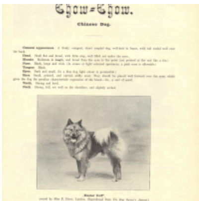
1897 - Chow Standard bookplates from Races de Chie...