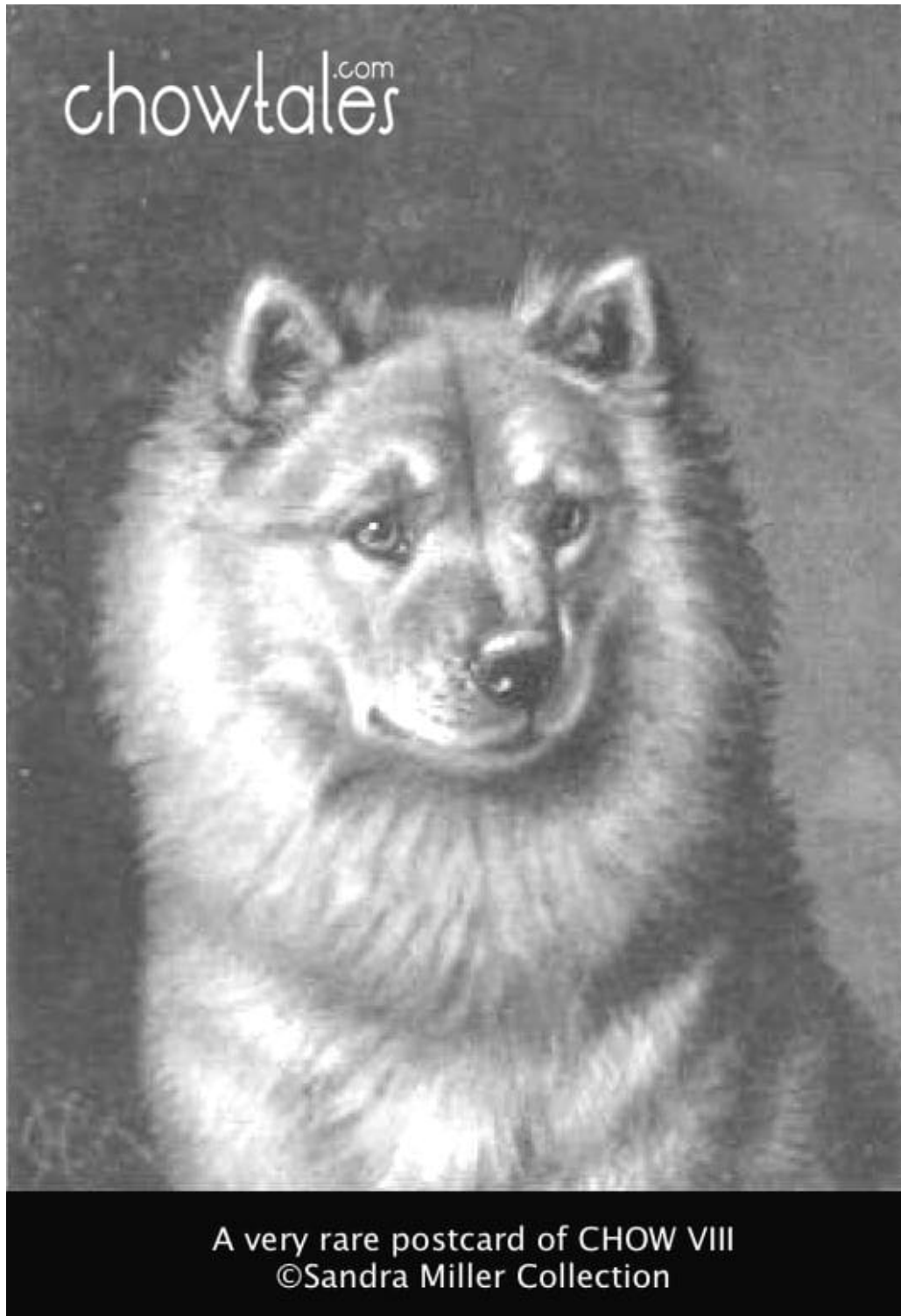
Chow VIII very rare 1895 postcard

CLICK HERE TO READ THE FIRST AMERICAN CHOW STANDARD