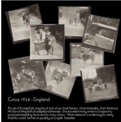
COLLECTION - Circa 1924 - Photo collection from E...