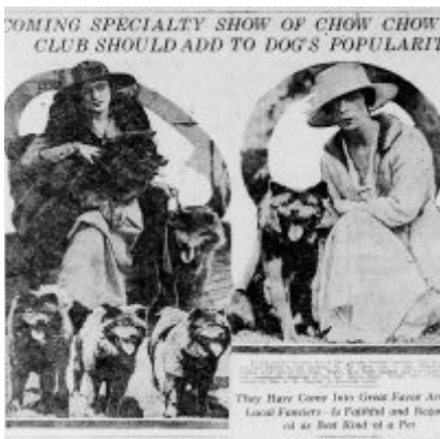
1918 ARTICLE- Rare images of breeders and chows. ...