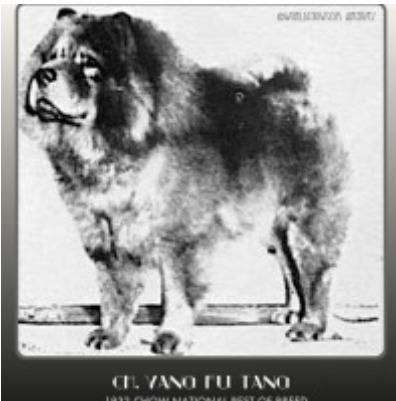
1929 TIME CAPSULE - CH YANG FU TANG - 1ST BIS RECO...