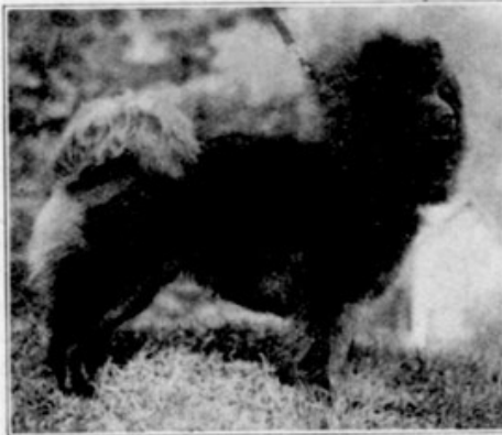
A Blue Chow Puppy