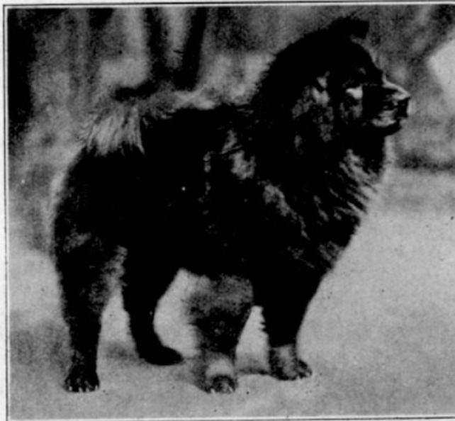
THE CHOW CHOW CHAMPION MOOSILAUKE PAO TANG

We are about to insert a classified inquiry concerning the resting place of Greenacre Jim. He has surely become a screen actor for all we get is a hasty flash of him between California and England, with an occasional stop for Winners bitches with the new blue.