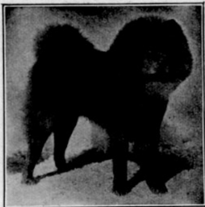
CH. TUTHY AME OF EL CHER EL-CHER KENNELS OFFER FOR SALE

25 Brood Matrons, bred and open; several show specimens included in this lot; all dark red, proven breeders. To make room for growing stock, prices are set at a very low figure.