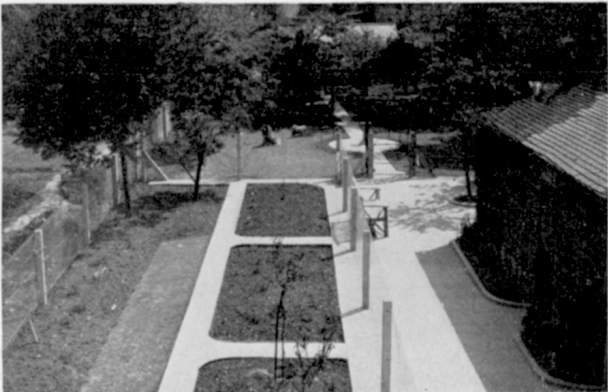
Showing part of the very beautiful surroundings of the MELCHUNG Kennels

This year has been a very successful one, and all dogs and bitches have been continually winning up and down the