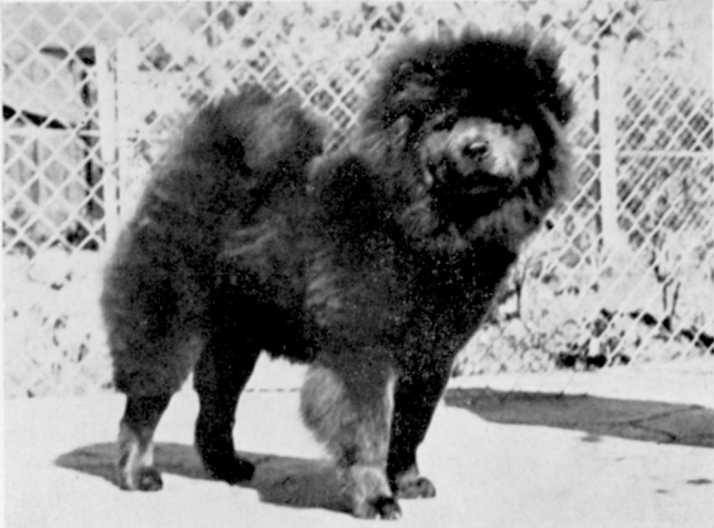
MAIRIM BLUE-CHUZI Sire: Cho-Sen-Blue. Dam: Ch. Mitzi of Gaywood