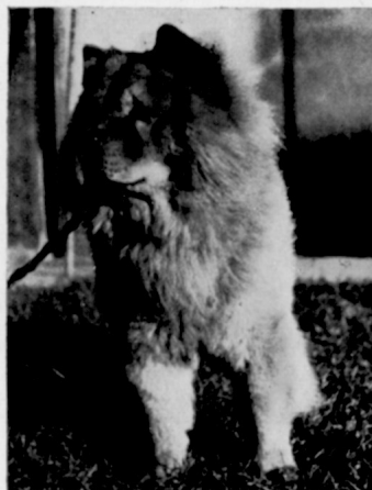
ANSELM OF PADUA