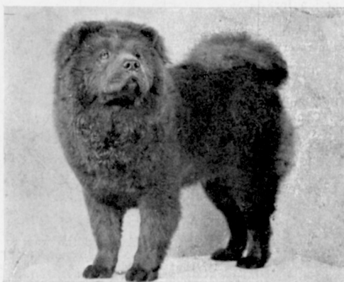
HAMPFIELD BLUE YEN (K.C.S.B. 202 AF) Seven months