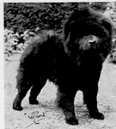
KEN-DEE OF ADEL

Puppies and young stock are usually available from well-bred bitches. A. O. Grindey.