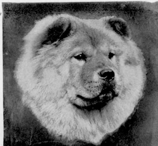
Head Study: CHOONAM FANG WENG

the quality of his head, the strength of muzzle, the small, tilted ears and the expression generally. A beautifully-shaped, medium-sized dog of superlative breeding and of an outstanding quality, such as is too seldom seen, he is now at stud in a kennel of easy access to all, and I can strongly recommend him as a stud proposition to all who desire true Chow type and quality in their stock, for he is siring first-class puppies. He gained a first at Leicester ch. show, his only outing this year.