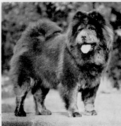
MAIRIM BLUE WOO TU

MRS. SIMPSON'S Chows are making a steady climb up the ladder of fame. They have been shown fearlessly at all the major shows, and I do not think they have ever been out of the money.