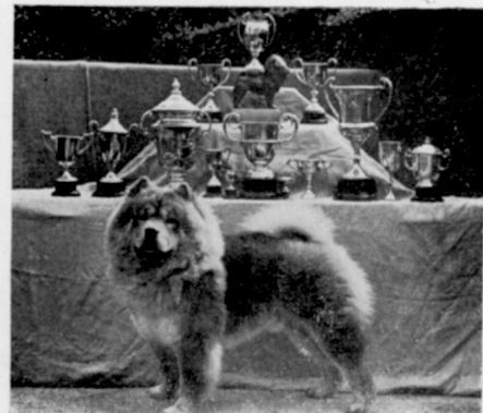
CH. SITRUC YUNG T'SUN