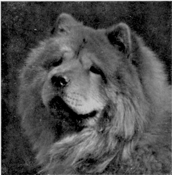
T'SIN-NING OF KIN-SHAN Sire: Commandant of T'sun-Choo. Dam: Sou Sing Eveon. Fu'l brother to the two post-war champions—previous litter—Ch. T'sai-Ting of Kin-Shan, Ch. Chang-T'sao of Kin-Shan