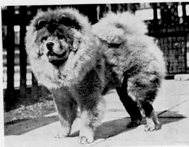
KI-PUNG OF HANOI

I am content to let the picture speak for itself as proof of the quality of the present-day products of this go-ahead kennel; sufficient to say that Ki-Pung is