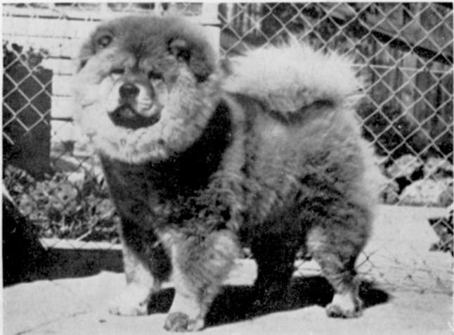
UNA OF BRINCHOW Sire: Ch. T'sai-Ting of Kin-Shan. Dam: Ch. Una-So-Sweet