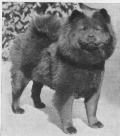
BLACK SOON-DE OF KIATANG