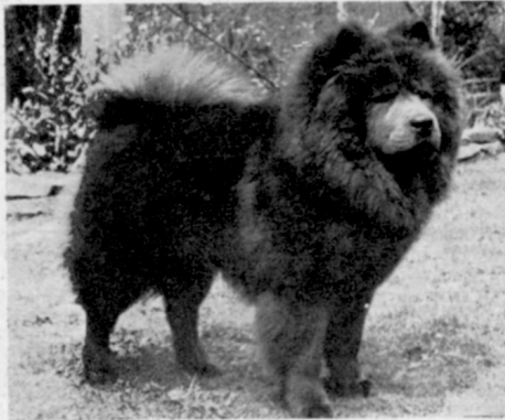
NITESOWN BLUE FANG at 8 months