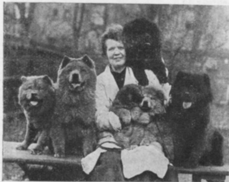
Some of the bitches: Sou Sing Bell, Sou Sing Golden Girl, Sou Sing Sutie, Sou Sing Sailer Girl, Sou Sing Prunella, and two five-weeks puppy bitches