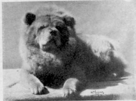
BRUTUS OF HO-PING