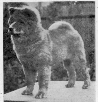
CATHAY CORAL (deep red shaded), aged 4 months, by Ch. Choonam Mong Yen (935 UU) ex Isabel of Padua (1209 AD)