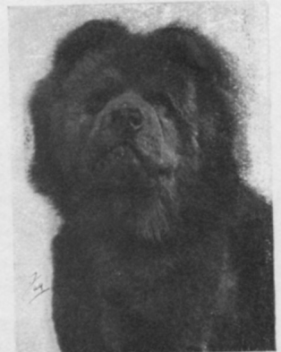
BLUE HUE OF WEY-MERE

THE star of this small, but select kennel is Blue Hue of Wey-Mere . A winner himself, he has sired blues already making a name in the show ring. His stud fee is 6 gns.