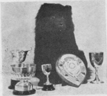
PRINCESS OF HAMPFIELD

THIS is a small, select kennel which is concentrating on the breeding of blacks and blues. Princess of Hampfield , a black bitch, is shown here with her winnings from two ch. shows. Also bred here are the two puppies, Hampfield Blue Yen and Hampfield Blue Susie . Both have already won firsts and been reserve dog and bitch in breed at the age of seven months. The stud dogs here are Auster Blue Kang Ti (blue bred for the last four generations) and Ho Tung of Hampfield , a red son of Ch. Choonam Ho Tung. He is the sire of Princess of H. The fee for either of these dogs is 6 gns. Puppies at these kennels are reared regardless of expense and are worth very careful consideration when offered for sale.