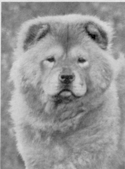
CH. ANTHEA OF BARWICK