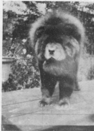
SOU SING BLAZE At six months old By Sou Sing Wuzeela Ta ex Winsum of Sou Sing