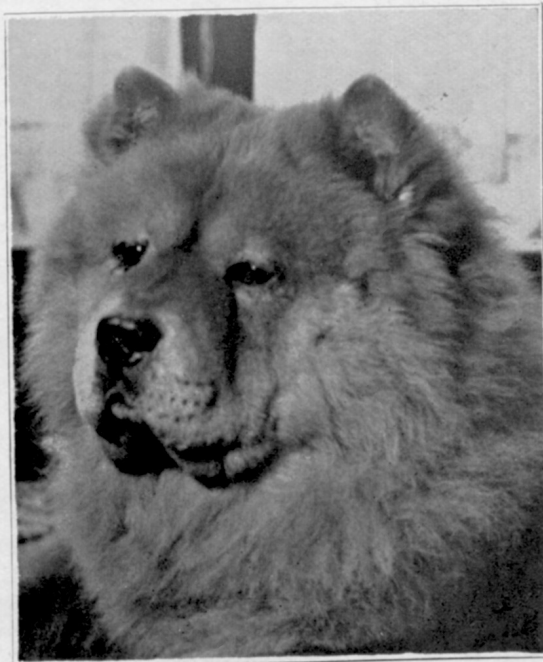
CHOONAM PENG TZU