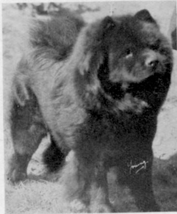
LIU CHO OF HANOI