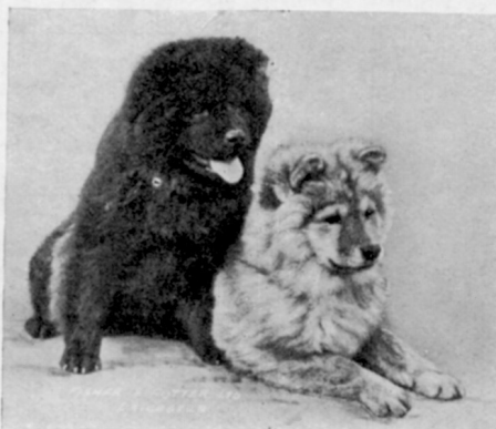
Two Puppies, BLACK SAI-YING OF ADEL and SHEN T'SU OF ADEL (both by Black Shoh-Dee of Adel ex Sultana of Adel).

Black Shoh-Dee of Adel looks like emulating his sire, Minos of Adel (black), as a stud force. Minos' stock is doing well all over the country.