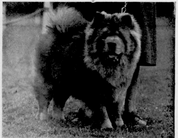
CHU-KOL OF KIN-SHAN , born 26/10/45, by Ru-Chang of Kin-Shan ex Hwan of Kin-Shan

K KNOWN throughout the world for their excellent type, grand heads, correct Chow-like expression, huge bone, short coupled bodies with plenty of substance. We illustrate a pair of typical Kin-Shans.