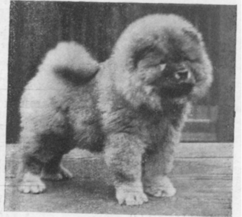
SOU SING KOKO at seven weeks By Sou Sing Commander ex Sou Sing Sutie

The following dogs are at stud: Sou Sing Commander (son of that big winner, Sou Sing Blaze); Sou Sing Delight (litter brother to Sou Sing Blaze); Sou Sing Jupiter Blaze (son of Delight); Sou Sing Jupiter Craze (son of Choonam Hu Chung); Sou Sing Comet (grandson of Ch. Rochow Adjutant).