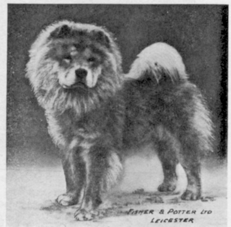
LEE WONG OF ADEL (By Ch. Choonam Mong Yen ex Chand Bi Bi of Adel)