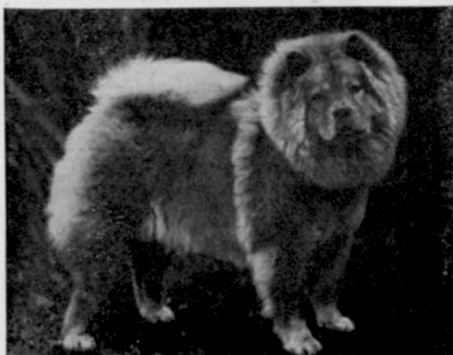
JO-SAN RAPUNZEL By Ch. Li Wu Fah ex Jo-San Pau-Ki