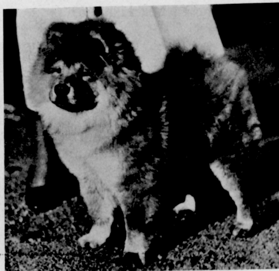
KO-WA HAUT MAJEUR

well-proportioned light red, and sire of excellent stock; fee 8 gns.