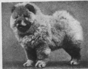
LINDA ROSA By Choonam Chi Mung ex Miriam

I must mention that wonderful dog, Drummer Boy , a son of Ch. Rochow Dragon out of Long Acre Dawn. Now in his fourteenth year, he is still hale and hearty.