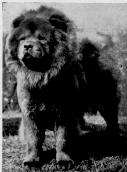
CH. VIKING OF BARWICK