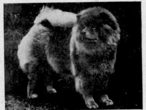
JO-JAN PAU-KI By Great Westwood Hercules ex Jo-Jan Otaki