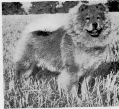
YU CHANG CHU OF T'SAIGON

THE photograph of the home-bred Yu Chang Chu of T'Saigon was taken at 15 months. He is by Bbornhot Shan Hi ex Choonam Chu Kiang, and in his short show career has annexed to date 90 first prizes under most of our