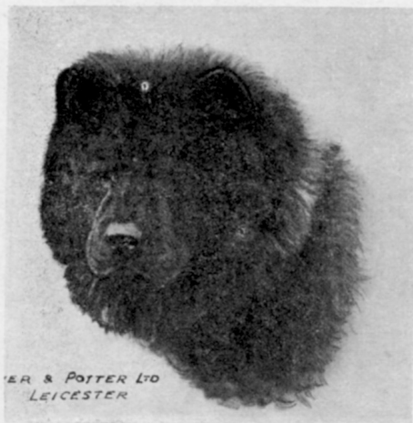
Head study, BLACK SHOH-DEE OF ADEL