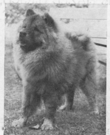
EDWARD OF PADUA

The bitch pictured here is the black, Soon-de of Kiatang , by Kwong Yeo of Subortna out of Moodey D'Hoo, and she also is a first prize winner. It is hoped to have puppies for sale